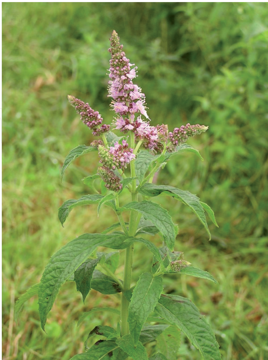
Figure 1. Morphology of Mentha longifolia.

and 1.5–3 cm broad, smooth, or wrinkled with sharply serrate margin. The stem is erect, square-shaped, and light green to reddish green. Inflorescence, slender spikes produces pink, white, or lavender flowers in disrepute terminal spikes; bisexual, calyx short tubular, 1–2.5 mm, calyx short tubular, 1–2.5 mm, glabrous; corolla short tubular, 2–4 mm, with 5 lobes, white to pink, four stamens, subequal, pistil with a single style, exserted, the fruit is nutlets, dry, ovoid, and tuberculate, ovary smooth [6–9].