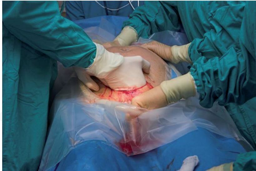
Figure 2. Allopathic health practitioners of the twenty-first century performing caesarean delivery.

medicinal products, beliefs and practices. Some solutions are yet to be explored and discovered. Reports confirmed that indigenous health practitioners have perfected the art of sciences long before colonizers and missionaries introduced western medicine. Their processes of diagnosis and patient management are documented as being thorough, scientific and of comparable standard to other practices.