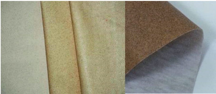
Figure 1. Vegan leather solutions based on sawdust (left) and coffee grounds (right).