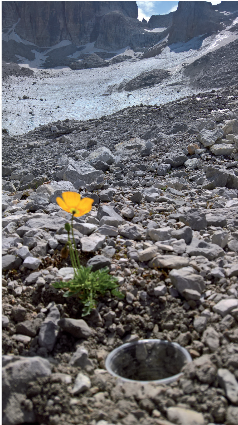
Figure 4. Pitfall trap near the front of the Agola Glacier (46°N, 10°E, Brenta Dolomites, Italy). Pitfall trapping is one of the most successful methods to collect ground-dwelling invertebrates at high altitudes during the snow free period.