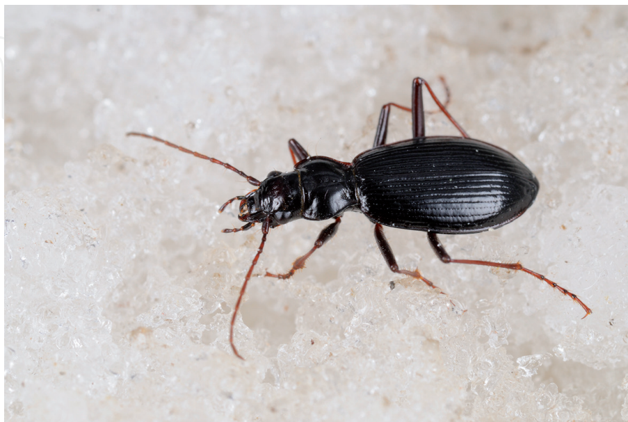
Figure 1. The ground beetle Nebria germari (approx. body length = 1 cm) walking on the Presena Glacier (2700 m a.s.l.) (Adamello-Presanella Mts., Italian Alps).

Ground beetles ( Figure 1 ) occur in almost all terrestrial environments and geographical areas and have different trophic requirements (e.g., predators, seed eaters and phytophagous), it is easy to collect them and their sensitivity to environmental and climate changes is known [19]. In addition, they can be considered among the most important meso- and macrofauna living on recently deglaciated terrains and on the glaciers in terms of species richness and abundance of individuals [13]. Last but not least, there is an ongoing awareness about the extinction risk for some endemic cryophilous species due to the habitat destruction (e.g., glacier