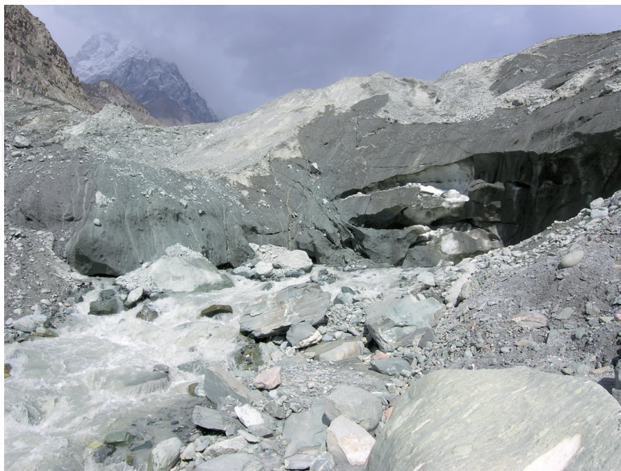
Figure 6. Dubani glacial stream at the glacier snout (3232 m a.s.l., 36°N, 74°E; Bagrote Valley, Karakoram range of northern Pakistan) (photo by L. Latella).

Non-biting midges are the main colonizers of glacier-fed streams around the world. Glacially dominated rivers are characterized by a deterministic nature of benthic communities due to the overriding conditions of low water temperature, low channel stability, low food availability and strong daily discharge fluctuations associated to glacier runoff ( Figure 6 ). A predictable longitudinal pattern of taxa richness and diversity increasing with distance from the glacier has been described for many European glacier-fed streams, starting from the kryal sector (where maximum water temperature is below 4°C), typically colonized almost exclusively by Diamesa species in the temperate regions [53]. D. steinboecki , D. goetghebueri , D. tonsa , D. zernyi and D. bohemani are the species more frequent and abundant in kryal sites in the Palearctic regions, followed by D. bertrami , D. latitarsis , D. modesta , D. hamaticornis and D. cinerella . Less frequent are D. martaе , D. nowickiana , D. longipes , D. wuelkeri and D. aberrata ; D. insignipes , D. dampfi , D. permacra and