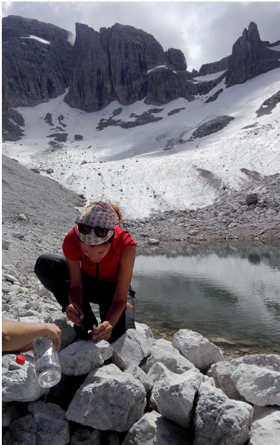
Figure 5. Catching Metriocnemus adults (non-biting midges) with tweezers on the shoreline of the Agola proglacial pond (2596 m a.s.l., 46°N, 10°E, Brenta Dolomites Mts., Italian Alps).

The zoobenthic community of Alpine proglacial ponds is dominated by chironomid Orthocnemiinae (generally representing >70% of the community) followed by Diamesinae ( Pseudokiefferiella parva and Diamesa spp.). Aquatic beetles (e.g., Elmidae, Dytiscidae and Hydrophilidae), Oligochaeta (e.g., Enchytraeidae) and Hydracarina frequently represent the remaining fauna. Overall, the richness is low, with few dozens of species colonizing the same pond. Few taxa might be found with high density, up to >1000 individuals/m 2 in ponds >2 ha and less than 2 m deep. Among orthocnemiids, semiterrestrial genera are frequent (e.g., Metriocnemus , Smittia and Parasmittia ), being environments that undergo high water level fluctuations during the ice-free period [49] (Figure 5). There is evidence of colonization by up to 4–5 congeneric species of Metriocnemus in