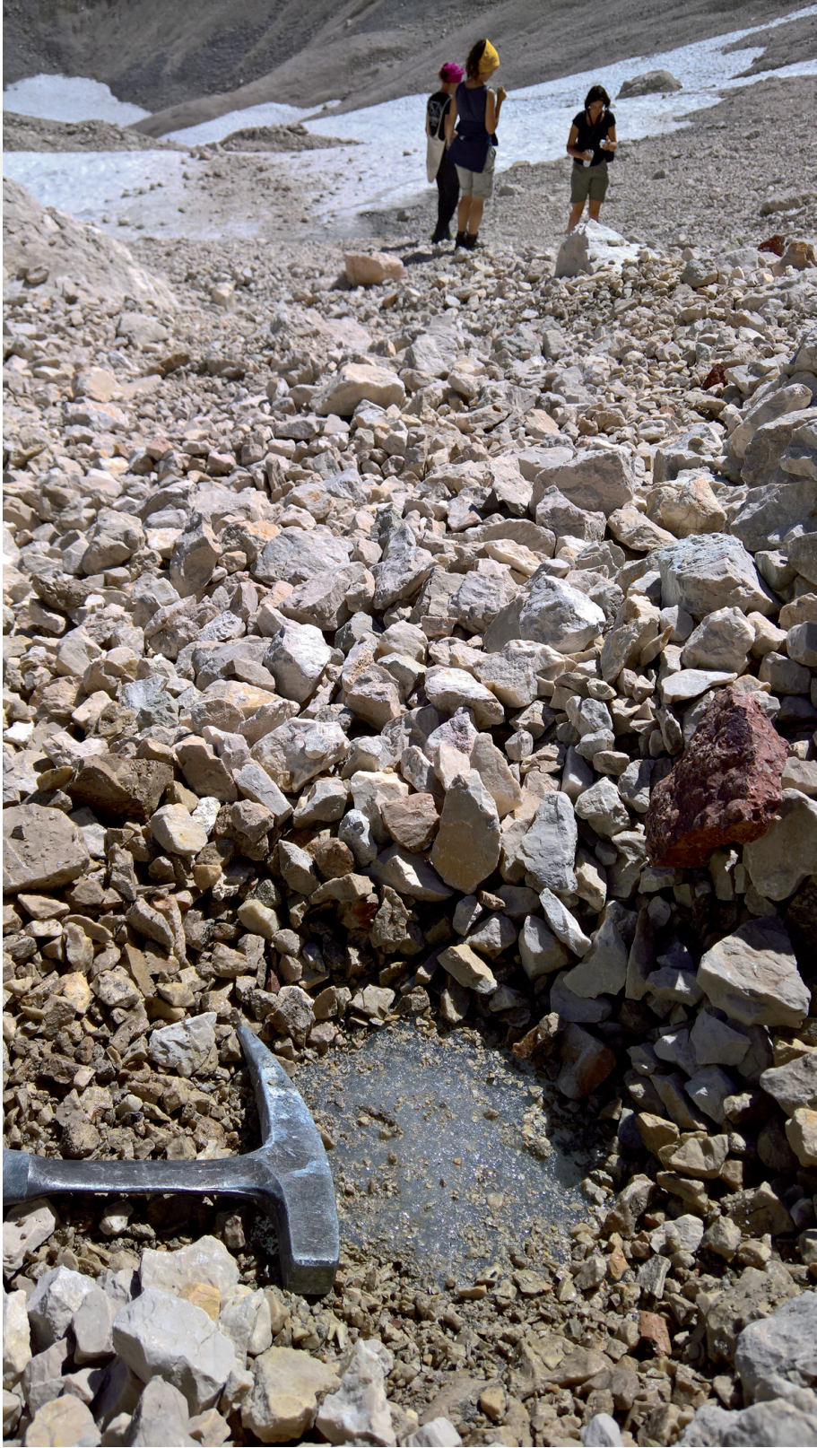
Figure 3. Stony debris covering the surface of the Sorapiss Centrale glacier (45°N, 12°E, Ampezzo Dolomites, Italian Alps); it hosts permanent populations of cold-adapted ground beetles, spiders and springtails.

far from the glacier front because more competitive in terms of microhabitat and resource availability [35]. In the contest of the ongoing climate warming, it is interesting to highlight that an increase of 0.6°C in summer temperatures approximately doubled the speed of initial colonization, whereas later successional stages were less sensitive to climate change [39].