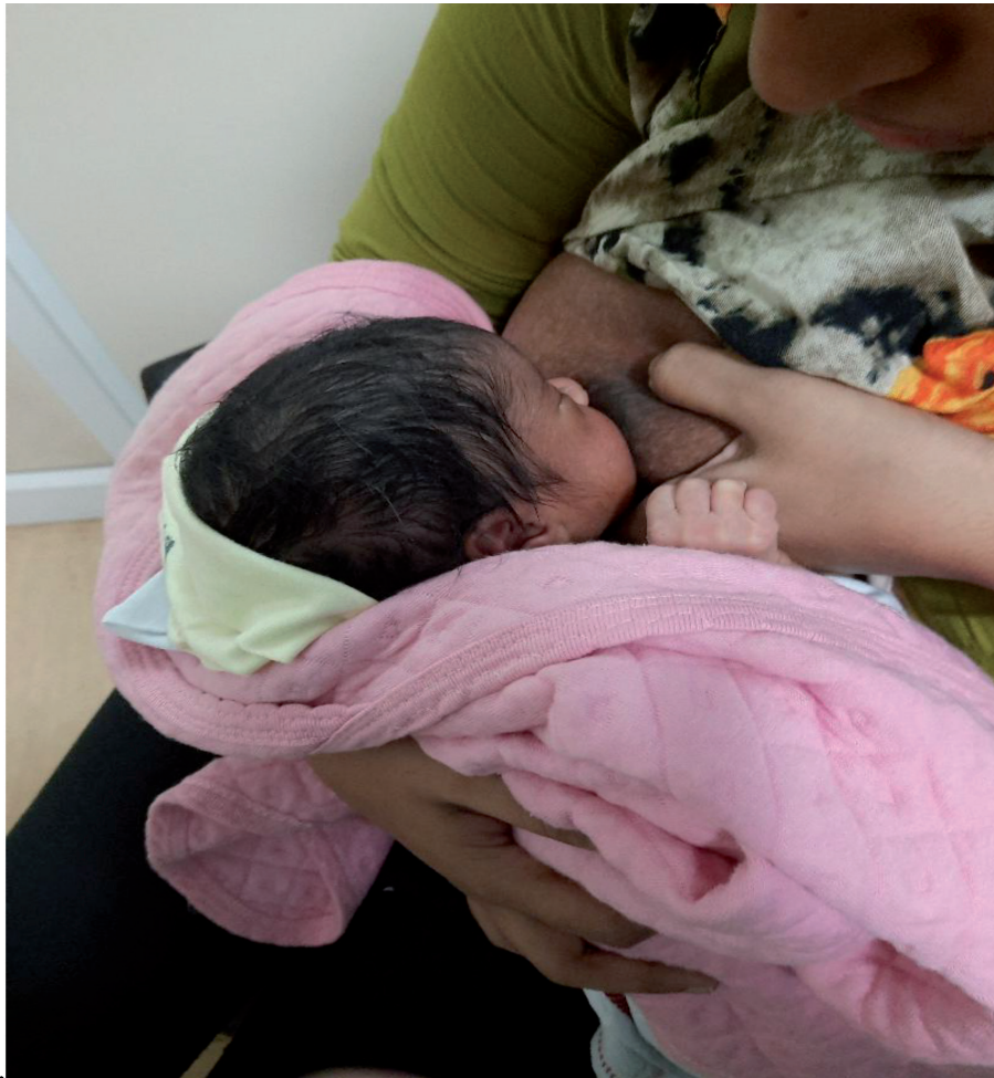
Figure 1. Correct technique of breastfeeding (cradle hold).

Burping: When the baby sucks the breast, air goes in which causes colic, regurgitation and abdominal distension; hence burping is necessary. Burping is done by putting the baby on the left shoulder and gently patting his/her back or by making him/her sit on his/her mother's lap with support and gently patting the back [7].