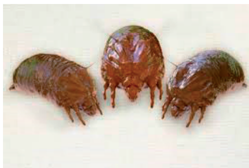
Figure 1. House dust mites.

Mites of family Tarsonemidae have modified legs IV (reduced, enlarged with a single tarsal claw on male, setiform on female); body with series of overlapping plates; and gnathosoma cone-like, enclosing minute palps and chelicerae. When mites are not as mentioned above, they may be with striated cuticle (family