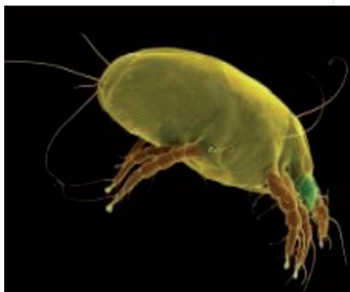
Figure 3. Dermatophagoides pteronyssinus .

The life cycle of D. pteronyssinus has been studied at 25°C and 80% relative humidity. Observations made on freshly laid eggs until they develop into adults and periods between different stages are recorded. The life cycle of D. pteronyssinus consists of five stages: egg, larva, protonymph, tritonymph and adult. Adult females lay up to 40–80 eggs singly or in small groups of 3–5. After eggs hatch, a six-legged larva emerges and after two nymphal stages occur, an eight-legged nymph appears. The life cycle from egg to adult is about 1 month with the adult living an additional 1–3 months. The average life cycle for a house dust mite is 65–100 days. A mated female house dust mite can last up to 70 days, laying 60–100 eggs in the last 5 weeks of her life. The eggs required an average of 11.26 days to develop into adults.