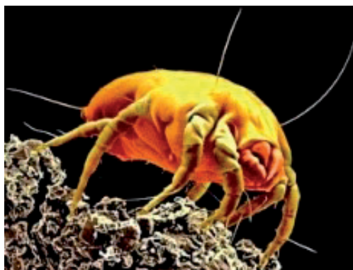
Figure 5. Dermatophagoides evansi .

Female with the distal part of the bursa copulatrix in the form of a small, oval and strongly sclerotized pocket, while male is with anal suckers ( Euroglyphus Fain), but male and female are without this combination of characters in Pyroglyphus . In Euroglyphus maynei (Cooreman), male trochanters I–III without hairs and is with a large oval anal plate spreading near to posterior edge of body, while female hairs ga, ae and those of trochanters I–III missing, and have a small posterior vulval lip that does not shelter to anterior of vulva. In case of Euroglyphus longior (Trouessart), male trochanters I–III with one hair and is with a minute hexagonal anal plate distant from posterior edge of the body. Female hairs ga, ae and those on trochanters I–III present, and posterior vulval lip is long nearly completely casing to vulva.