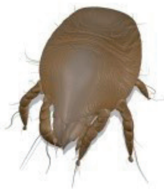
Figure 6. Euroglyphus maynei .

The reproductive biology of house dust mite E. maynei is not studied well. This mite is generally less common than D. pteronyssinus and D. farinae in homes. While it is present, it commonly coinhabits with species of Dermatophagoides and in geographic distribution, is more restricted. The period of life cycle (egg to adult) for E. maynei at 75% relative humidity as well as 23 and 30°C and fecundity at 75% RH and 23°C have been concluded, and data compared similar to data for D. pteronyssinus and D. farinae . Adults hatched from eggs at 23°C after 28 days and at 30°C in 20 days. At 23°C, females during a reproductive period of 24 days produced 1.4 eggs/day. At 23°C, mite E. maynei has a smaller life cycle than D. pteronyssinus and D. farinae ; however, at 30°C, this have a lengthier life cycle and produced fewer eggs than both mites [38].