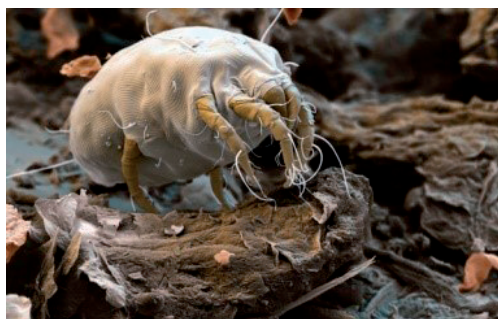
Figure 2. Dermatophagoides farinae .

Studies of the life cycle of cultured D. farinae found that after initial mating, D. farinae females lived for 63.3 days after their egg production period ended. The long period after cessation of egg production for D. farinae suggested that D. farinae females could mate multiple times and produce eggs continuously for a longer period. This study revealed that D. farinae females are capable of more than one successful mating that results in an increased egg production than that of a single mating. Females actively attract males during the reproductive period, but not