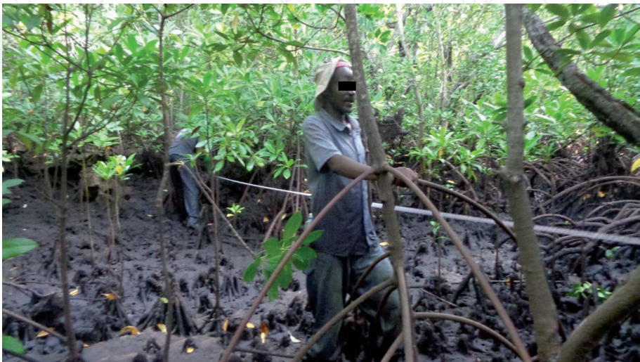
Figure 2. The figure is showing the way mangroves are adapted to increase offspring survival. In the foreground some offspring can be seen germinating on the parent and have quick growth rate.