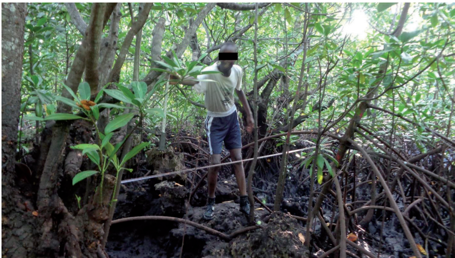
Figure 3. The figure is showing the way mangroves are adapted to survive by efficient nutrient uptake and use. This figure is clearly showing the large root/shoot ratio.

One of the major requirements for plant growth is need for enough nutrients. Mangroves have developed processes which enable them to take up and utilize nutrients efficiently from the soil which have low nutrient content. They have also developed nutrient conserving processes which include evergreenness, reabsorption of nutrients, immobilization of nutrients, and high root/shoot ratio [9]. Mangroves are also opportunistic in utilizing nutrients ( Figure 3 ).