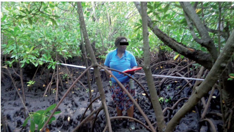
Figure 4. The figure is showing the way mangroves are adapted to lessen internal water loss. The shiny and succulent leaves can be seen on the left side of the photo.