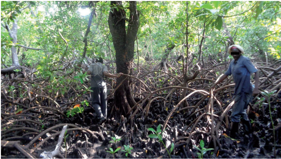
Figure 1. The figure is showing the way mangroves are adapted to survive in the waterlogged soft substrate for growth by having widely spaced and dense root system.

The mangroves' various adaptations depend on the species. The red mangroves have lenticels which are propped above the water to absorb oxygen through the bark of the tree, while black mangroves have pneumatophores. The pneumatophores are root-like structures which are specialized and stick out of the saline water to enable