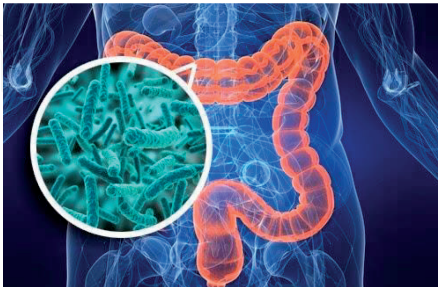
Figure 1. Gut microbiome is mainly located in the colon.

Gut microbiome is established within the few first years of life and contains up to 100 trillion microbes, mainly bacteria (more than 1,000 species) but also fungi, protozoa, archaea, and viruses. The taxonomic ranking of gut microbiome includes species, genera, families, orders, classes, and phyla. Most of the species belong to Actinobacteria, Bacteroidetes, Firmicutes, Proteobacteria, and Verrucomicrobia phyla. The predominant phyla (90%) are Firmicutes (e.g., Ruminococcus and Lactobacillus genera) and Bacteroidetes (e.g., Bacteroides and Prevotella genera). Three enterotypes with functional differences have been defined based on variation in the level of genera: Enterotype 1 ( Bacteroides ), Enterotype 2 ( Prevotella ), and Enterotype 3 ( Ruminococcus ).