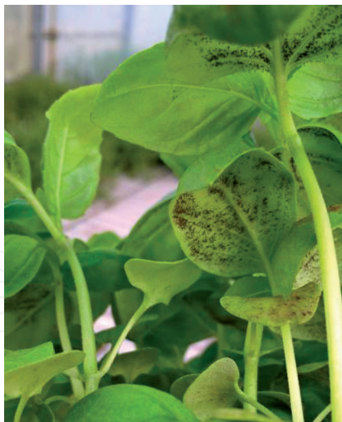
Figure 1. Brown growth of Peronospora belbahrii on abaxial side of basil leaf.

occur after chlorosis and the central portion of a chlorotic lesion become necrotic. This can lead to slight curvature of leaves. Necrotic spots are variable in size and of irregular shape as they are limited by the main veins. In some cases, entire area of the leaf surface is affected. In humid conditions, necrotic regions can become dark brown to black in colour. On abaxial leaf surfaces, both in chlorotic and necrotic regions, a typical greyish to brown, furry or downy moulds could be observed giving the leaves a dirty appearance ( Figure 1 ). Parasitisation results in shrinkage of leaf and premature leaf fall.