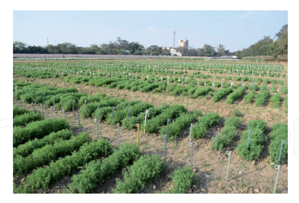
Figure 2. Field view of lentil characterization program at ICAR-NBPGR, India.