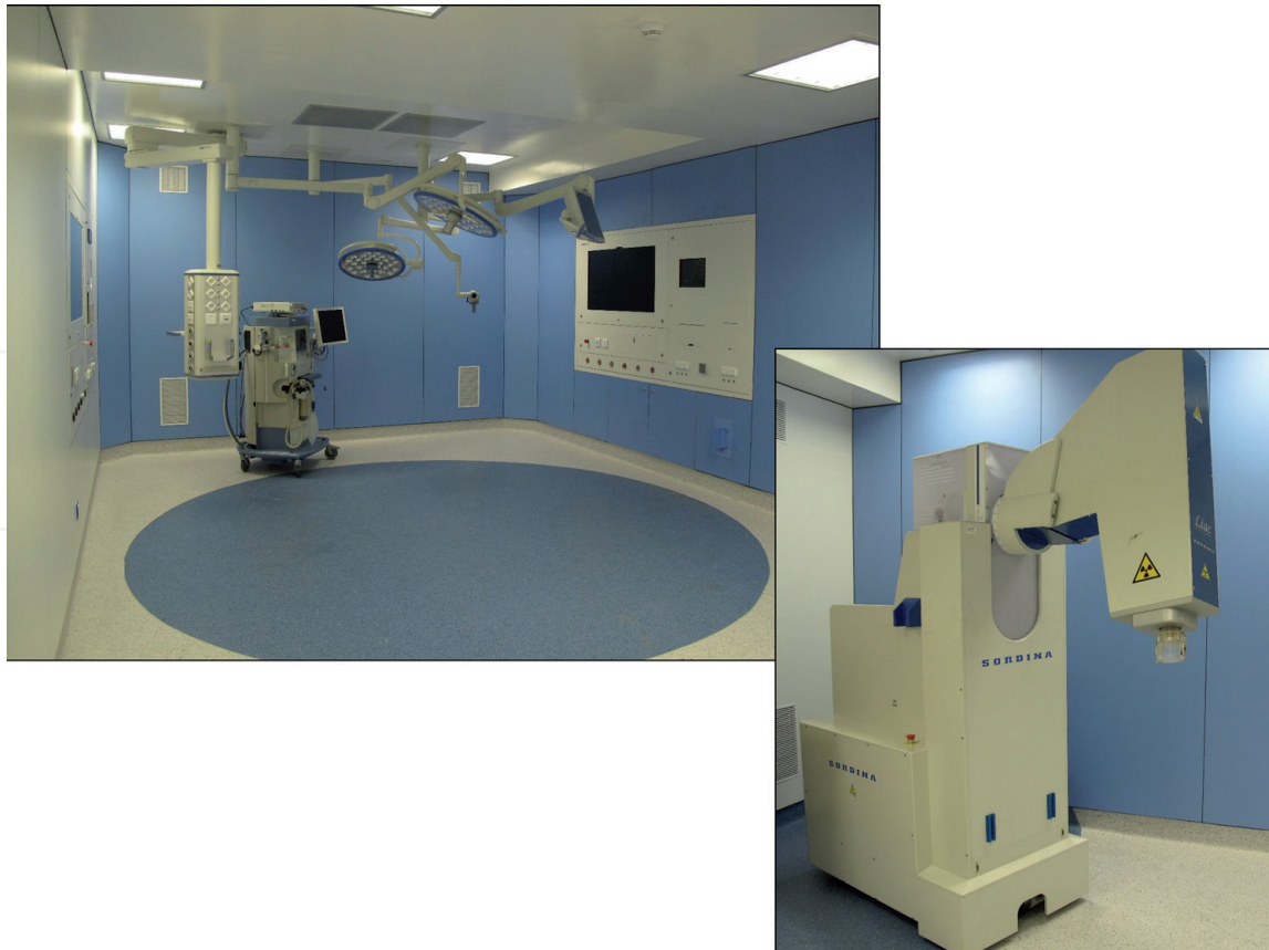
Figure 2. Operating room designed for IORT and equipped with a mobile electron linear accelerator (LIAC). Hospital clinic. The University of Barcelona.