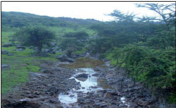
Figure 5. Water pollution by liquid waste discharge from one of the biggest quarry of Midroc, Addis Ababa [6].