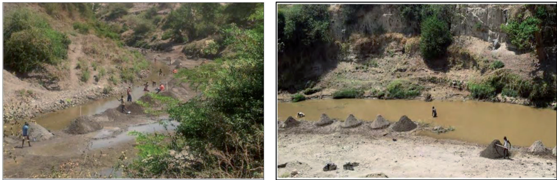
Figure 2. Production of fine aggregate in Ethiopia [6].