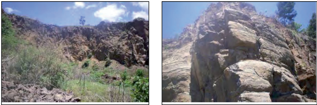
Figure 4. Abandoned quarry site at Augusta, Addis Ababa, Ethiopia [11].