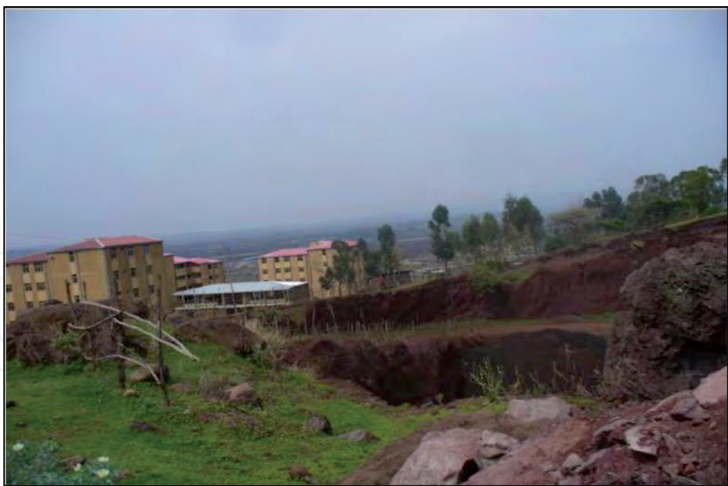
Figure 6. Coarse aggregate crushing plants have effect on nearby inhabitants [14].

fisheries productivity, biodiversity, and recreational potential. Severely degraded channels may lower land and aesthetic values [6].