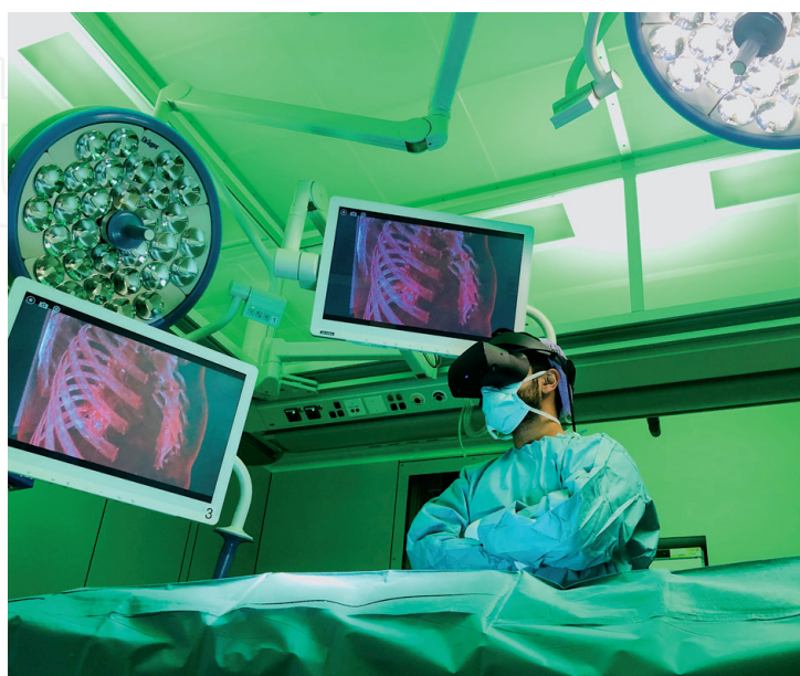
Figure 2. An example of virtual reality application during minimally invasive lung cancer surgery in the operating theater.

However, only very few reports are available on the use of AR, VR, or MR for surgical planning or intraoperative navigation for lung surgery [53–55]. Frajhof