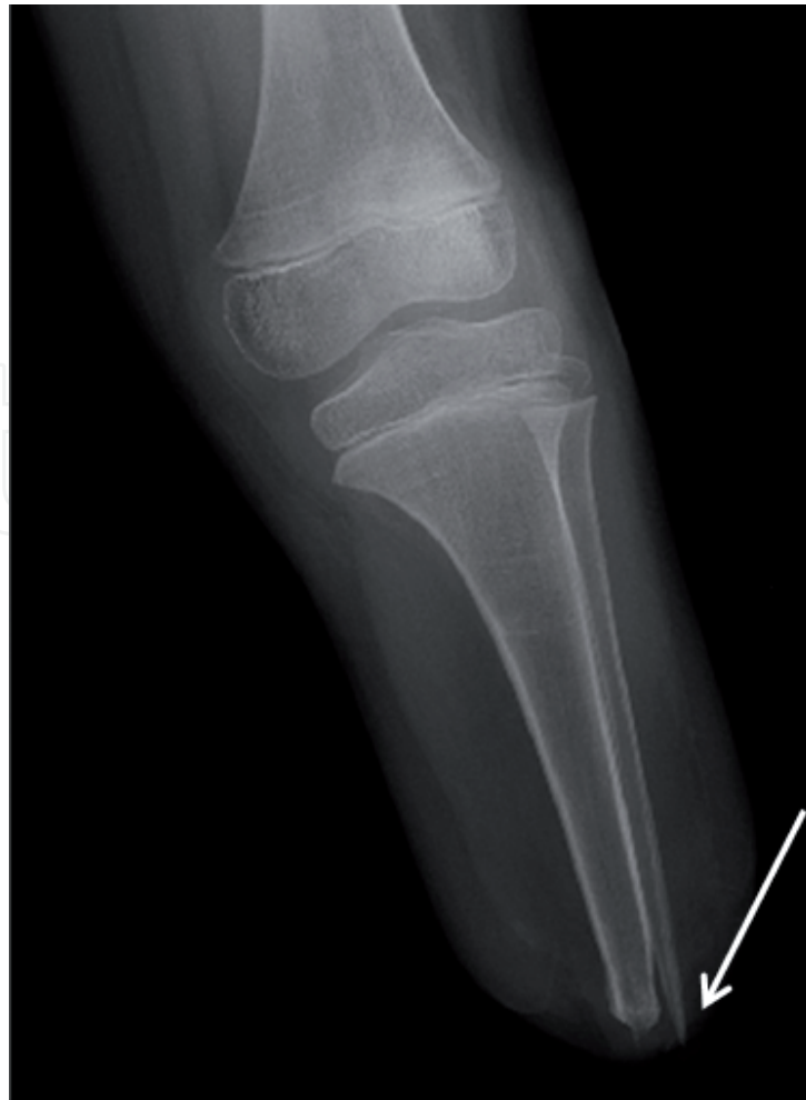
Figure 1. X-ray of distal tibia and fibula overgrowth, arrow is indicating the sharp end of overgrown spike.

Aitke postulated that bone overgrowth in congenital cases is due to intrauterine amputation (amniotic band syndrome) rather than true agenesis, considering that bone overgrowth does not occur in congenital agenesis; however, this assumption has not been proven [7]. An increased prevalence of overgrowth has been reported in patients who had previously undergone surgery for overgrowth [3, 11, 12]. Last, metaphyseal level amputations carry a higher risk of overgrowth than diaphyseal level amputations [1, 5].