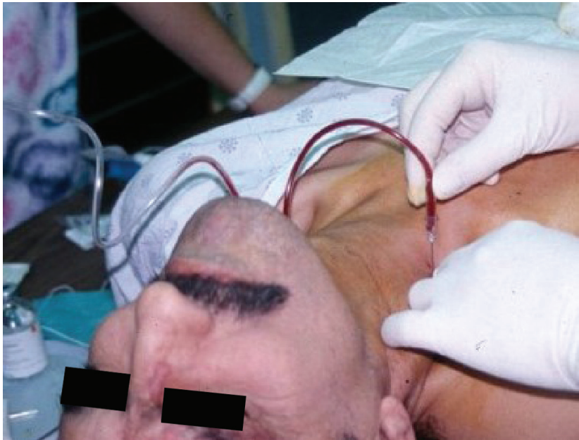
Figure 2. Accidental arterial puncture during a stellate ganglion block in a patient with postherpetic neuropathy.

is equally rapid since LA quickly redistributes from the cerebral circulation [25].