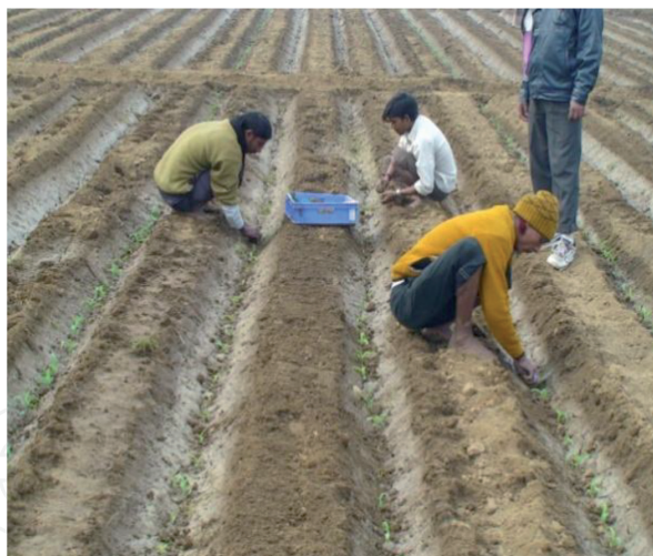
Figure 4. Maize crop establishment through transplanting system.

infiltration rate and low water holding capacity, so farmers can go for flat planting of maize crop. Under rainfed conditions, to have better moisture availability to crop for longer period, flat planting becomes better alternate. Flat planting is also beneficial when no tillage system gets infested with high weed population and chemical/manual weed control becomes non-economical [7, 8].