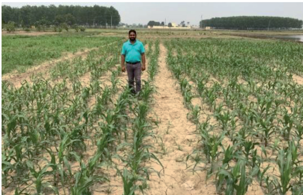
Figure 3. Flat sowing of maize crop.

20–30%. Under temporary excess soil moisture/water logging due to heavy rains, the furrows will act as drainage channels and crop can be saved from excess soil moisture stress [2, 5, 7, 8].