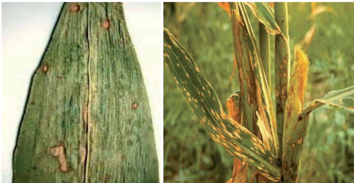
Figure 13. Maydis leaf blight attack in maize crop.

Banded leaf and sheath blight: Water soaked, straw colored necrotic lesions alternating with dark brown bands develop on basal leaf sheaths ( Figure 12 ). Lesions enlarge and coalesce with each other. Later, sclerotia develop on diseased sheaths, husk and cobs. In severe cases, developing ears are completely damaged and dry up prematurely with cracking of husk. To manage this disease, spray 250 ml Amistar Top 325 SC (azoxystrobin + difenoconazole) in 200 L of water/ha at disease appearance. If needed, repeat the spray at 15 days interval [1–3].