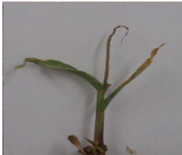
Figure 9. Attack of shoot fly in maize crop.

Hairy caterpillar: This pest becomes a serious concern when attacks in epidemic form. They damage the crop by feeding on leaves and soft stem, from gregarious (during younger stage) to distant migration (grown up stage). Prevention and protection strategies can be as follow: