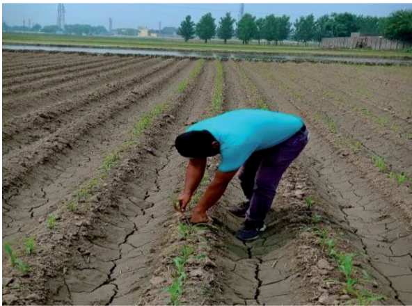
Figure 2. Planting of maize crop on the ridges.