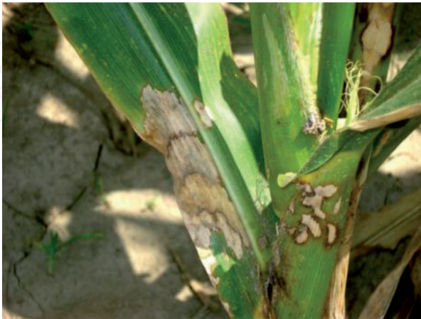
Figure 12. Maize crop infested with banded leaf and sheath blight.