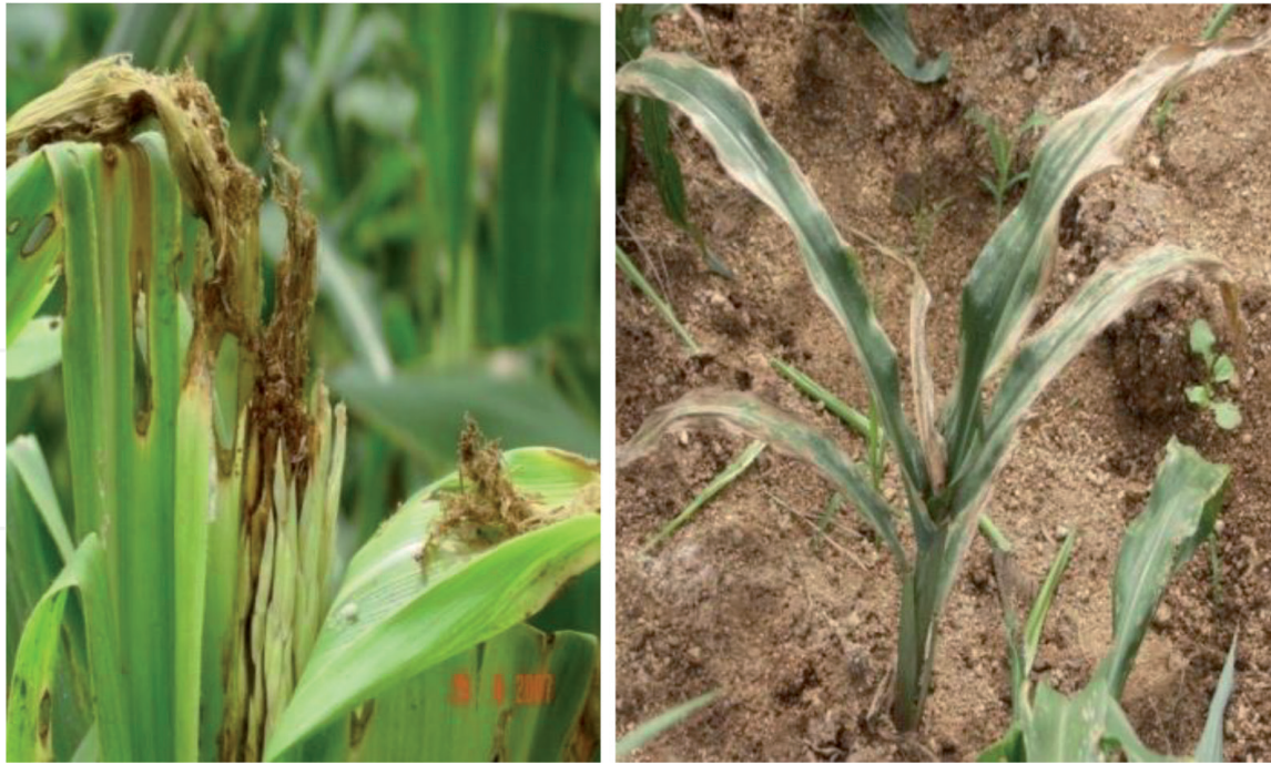
Figure 8. Damage of maize crop by maize stem borer.