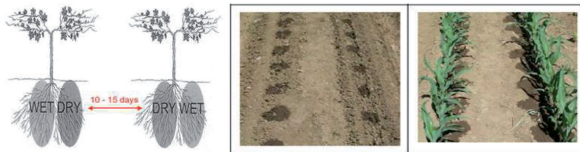
Figure 6. Field view of partial root drying irrigation technique in maize.

root zone, controlled alternate subsurface drip irrigation on half part of the root zone or controlled alternate furrow irrigation [10].