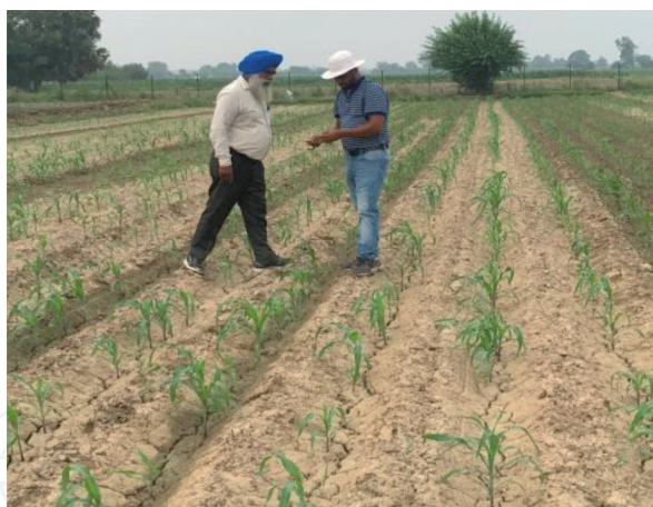
Figure 5. Crop establishment by furrow planting.

filling (GF) are critical stages and hence irrigation should be ensured at these stages [2, 7, 8].