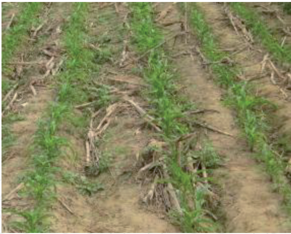
Figure 1. Maize crop sown under zero tillage system.