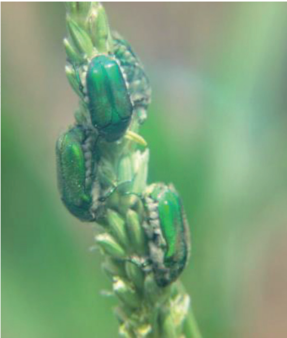
Figure 11. Attack of pollen eating beetle on maize tassels.