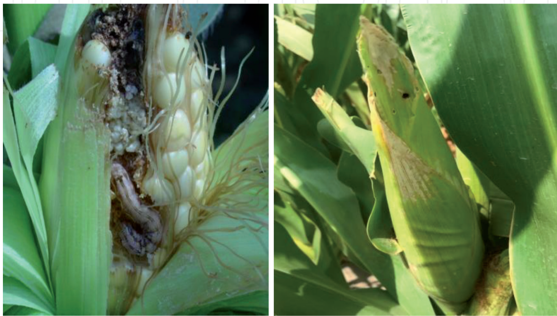
Figure 10. Attack of army worm in maize crop.

Seed rot and seedling blight: Poor germination, unthrifty seedlings and seedling mortality are the symptoms. Use disease free seed [7, 8].