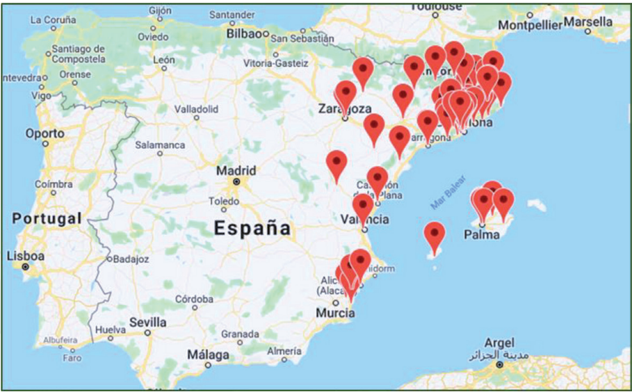
Figure 1. Centers of the Antidotes Network in Spain.