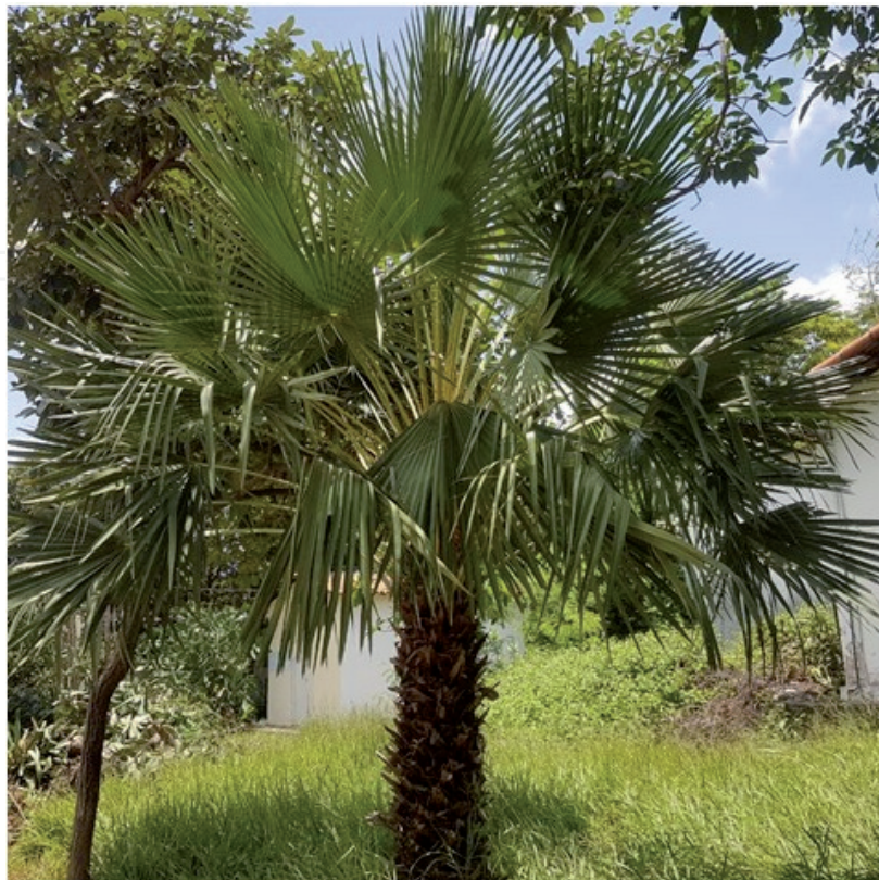
Figure 1. Copernicia prunifera tree (from Fortaleza, Brazil).

Carnauba wax is derived besides the leaves regarding the Copernicia prunifera tree ( Figure 1 ) and is made principally out of long-chain wax esters (80%), 20% contained fatty acids, fatty alcohols, and hydrocarbons [7–9]. Carnauba wax has the most maximum melting point conditions of all vegetable waxes and has been utilized in an assortment of items, including cosmetic and food products, nourishment items, and the paper area [9]. Additionally, this material is widely used in folk medicine, including the treatment of rheumatism and syphilis. However, carnauba