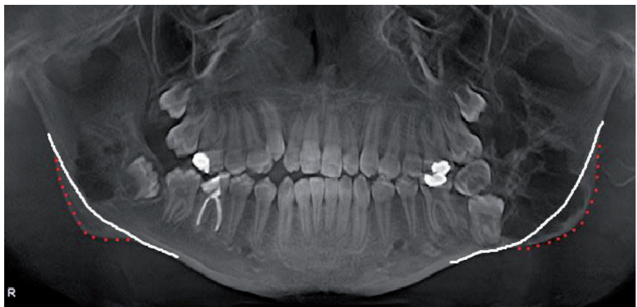
Figure 4. CBCT panoramic reconstruction of a Cherubism showing aberrancy from the normal data set.

because now each aberrancy pointed out in the last step, is represented by a vector. These vectors can be mathematically represented in the space which is important to gauge anything in the machine's learning pattern, which is the basis of AI systems. These pattern analyses and machine learning can be used in any system to quantify the data and convert those into the computer's language [29–32].