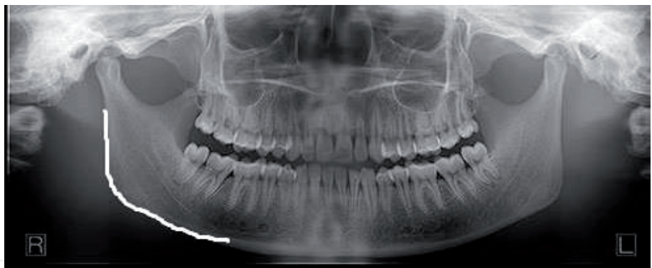
Figure 3. CBCT panoramic reconstruction with demarcation of the anatomic structure showing the lower border of the mandible.