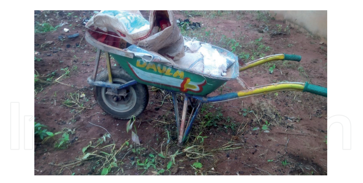
Figure 5. Wheelbarrow for conveying load.