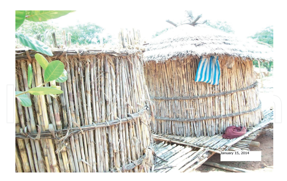
Figure 1. Maize cobs stored in a typical crib in Bassa, Kogi State.

In order to reduce the moisture content of maize, it has to be dried to 10–11% moisture content before storing it [18]. Some have advocated drying it to moisture of 13–14% [19]. However, the former seem to increase the shelf life of stored maize because the dryer the maize, the better it is stored. For proper drying of maize, it may be left spread on a mat or any platform over several days; it could also be taken to the drying machine which blows hot air over the grains. After it must have been dried to the desired moisture content, the maize grains can then be stored in silos (metal or earthened) or in bags over a long period of time without deteriorate and become mouldy during storage.