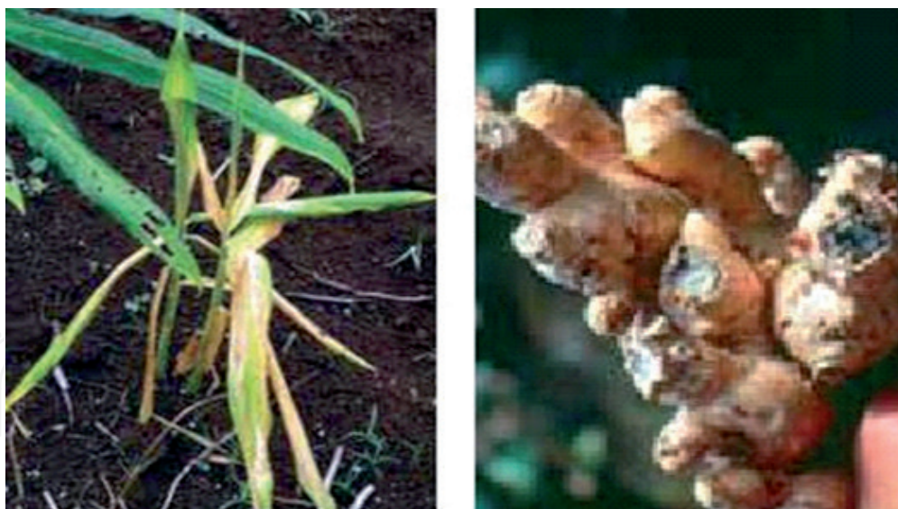
Figure 2. Yellowing of leaves and oozing of rhizome due to bacteria wilt disease (source: Vikaspedia).

to date. Four biotypes of R. solanacearum have been identified so far. Biotype III from India causes the wilt in ginger [11]. Biotype III of the bacterium cause slow wilt and biotype IV causes rapid wilting and death [12]. Biotype III is restricted to ginger plant and its weeds whereas biotype IV infects a wide host range including potato, tomato, eggplant, Capsicum frutescens , Zinnia elegans and Physalis peruviana . Biotype II is reported to infect only potato plants [13]. In Indonesia, the race 1 of biovar III is responsible for bacterial wilt in ginger [14]. Nematodes in the soil increase the incidence of wilt in ginger [15]. Nelson [16] observed that the host range of race 4 of biovar III of R. solanacearum is restricted to edible ginger. Twelve of 14 species of ginger belonging to Zingiberaceae and Costaceae are highly susceptible to all the strains of race 4 and susceptible plants wilted within 21 days [17].