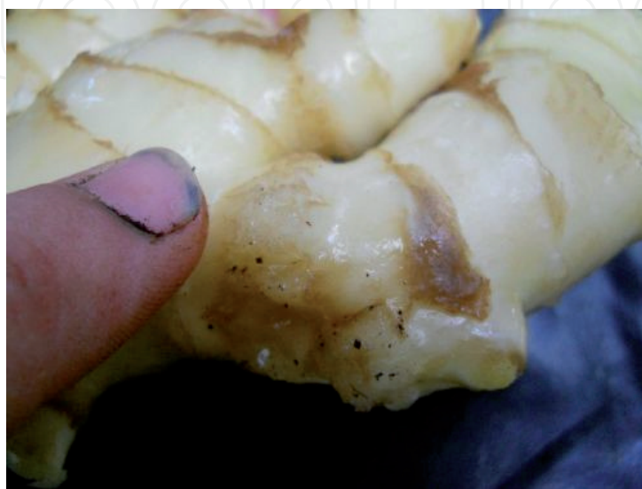
Figure 6. Brown lesions on the root knot nematode infected rhizome (below).

Infected plants exhibits stunting, reduced vigor and tillering. Top most leaves become chlorotic with scorched tips. Infected plants show yellow leaves with less