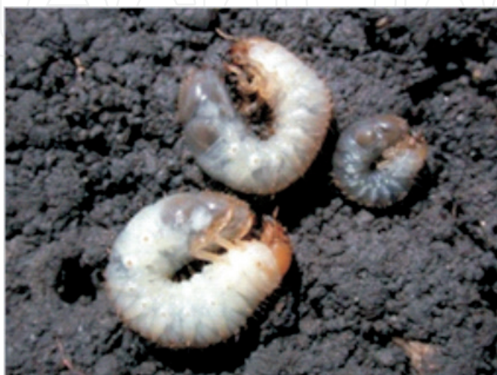
Figure 8. Holotrichia responsible for white grub in ginger (source: Ref. [159]).

The Chinese rose beetle, Adoretus sinicus (Burm.), ( Figure 10 ) is pale reddish-brown and has nocturnal feeding habits. The damage on the foliage is characteristic, being peppered or shot with holes, or more or less skeletonized. The eggs, which are