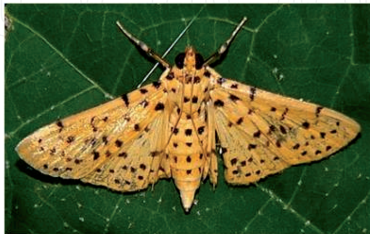
Figure 7. Dichocoris punctiferalis cause shoot borer in the ginger.

It feeds the base of the pseudo stem, roots and newly formed rhizomes. Pest infestation leads to yellowing of the leaves. It make large hole in the rhizome and reduce its market value. The entire crop may be lost in severely infested plantations. The adults are dark brown beetles and measures about 2.5 mm x 1.5 mm in size. The grubs are creamy white and live in soil.