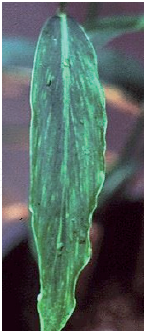
Figure 1. Chlorotic fleck symptoms on ginger leaf.

It differs from mosaic virus in particle properties, host range and serology. Many properties namely size of particles, possession of ssRNA, salt-labile nature of particles and a limited host range of this virus are similar to sobemovirus group [7] but it, serologically unrelated to several sobemoviruses including lucerne transient streak virus, cocksfoot mottle virus, sowbane mosaic virus, Solanum nodiflorum mottle virus, southern bean mosaic virus, velvet tobacco mottle virus and turnip rosette virus.