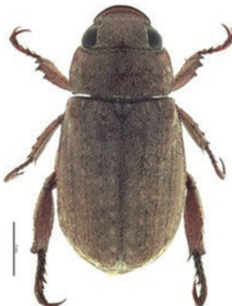
Figure 10. Chinese rose beetle.

laid in the soil, hatch in about 4 days, and the entire life cycle from egg to adult takes about 6–7 weeks. The larvae apparently feed on decaying plant material; pupation occurs in the soil. During the daytime, adults are usually found hiding in loose soil or among dead leaves. This pest is prevalent in the field at low elevations [160].