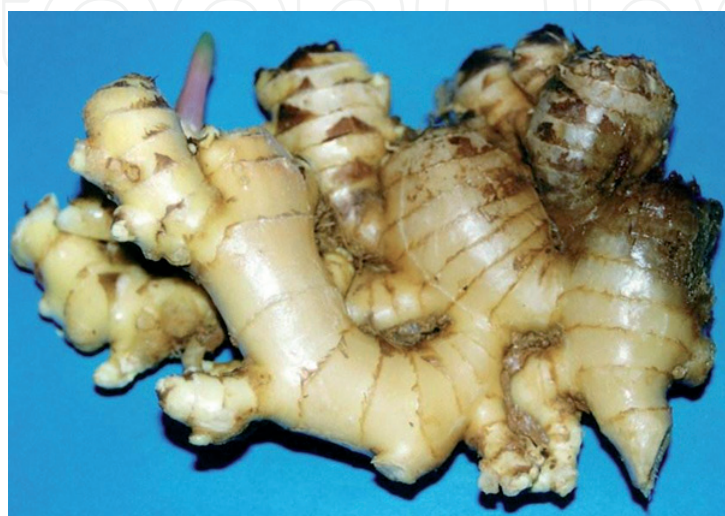
Figure 5. Rotting of rhizome due to the infestation of F. oxysporum.

Pathogenicity test is available for Acremonium murorum , Acrostalagmus luteo-albus , Fusarium sp., F. oxysporum , Lasioidiplodia theobromae and Sclerotium rolfsii associated storage rot [36].