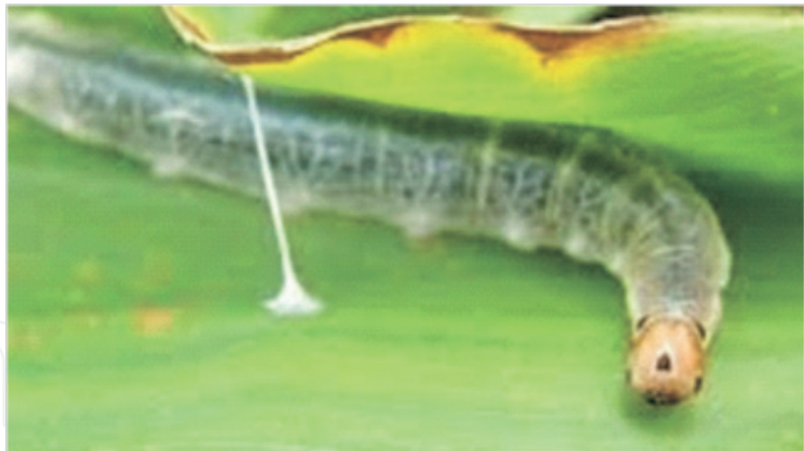
Figure 9. Udaspes folus causes leaf roller in ginger.