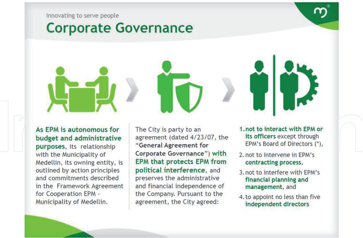
Figure 2. Corporate governance of EPM (examples from agreement between the City and the company) supplementary material from ID1, (EPM, 2016).

This quote is included as an example of how the two actors are arranged in efforts to deliver social goods in the city. Contextually, this quote is taken from a conversation related to the role of EPM and the municipality during and after the transformation which included social innovation efforts by the city and EPM.