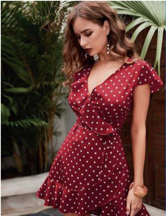
Figure 2. An example of a product that attracts less comments related to body shape and more related to the actual product.

The study has identified several challenges and limitations in doing this research. The findings can only be generalised according to the size of the sample. For instance, the process of identifying suitable posts on social media was deemed to be difficult as not many are directly related to fashion. Secondly, the process can be time-consuming as it involves going through comments and extracting patterns and meaning while looking at different sources and comments.