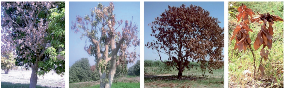
Figure 12. Mango sudden decline.