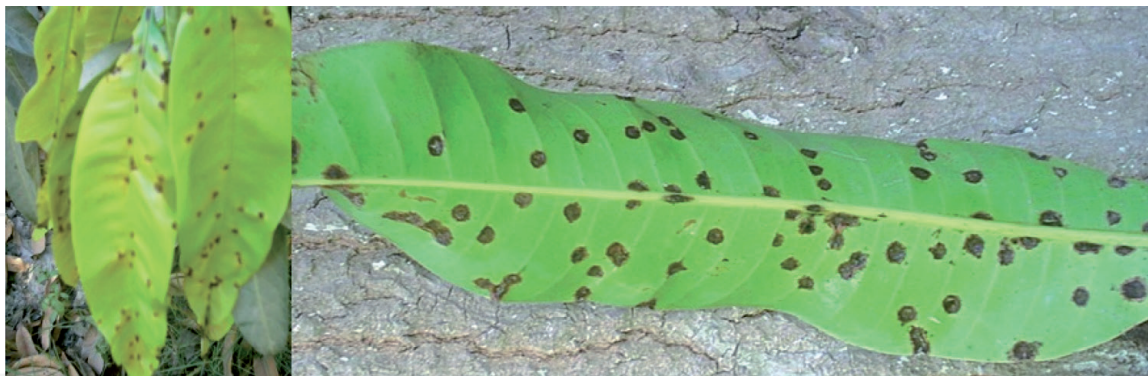
Figure 5. Bacterial leaf spot ( Erwinia mangiferae Doidge).