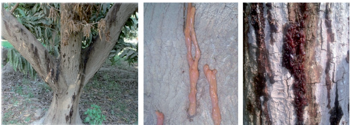
Figure 11. Gummosis (Lasiodiplodia theobromae).