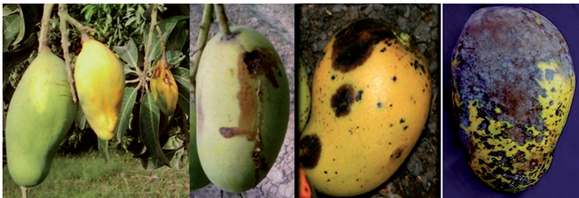
Figure 8. Fruit rot ( C. gloeosporioides and Aspergillus niger ).