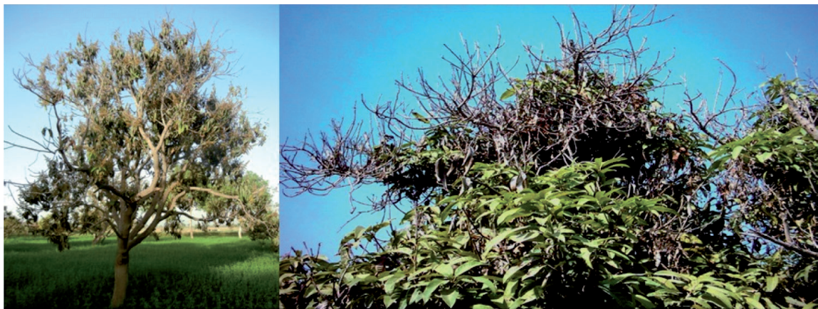
Figure 10. Dieback (Lasiodiplodia theobromae Pat.)