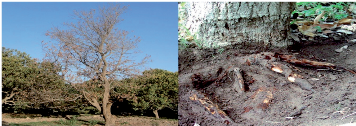
Figure 9. Root rot ( Rhizoctonia solani Kuhn and F. oxysporum Schl.).

dieback, Diplodia netalensis and Lasiodiplodia theobromae (Pat.) Griff. and Maubl. (Syn. Botryodiplodia theobromae Pat.) ( Figure 10 ); gummosis, L. theobromae ( Figure 11 ); and mango sudden decline ( Figure 12 ), a complex disease [28–38].