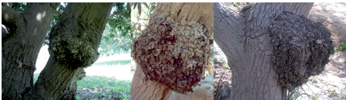
Figure 6. Crown gall ( Agrobacterium tumefaciens ).