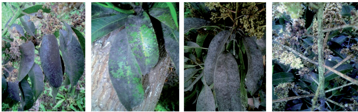
Figure 7. Sooty mold ( Capnodium mangiferae ).