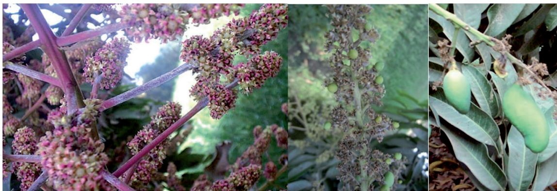
Figure 3. Powdery mildew disease ( Oidium mangiferae Bert.).