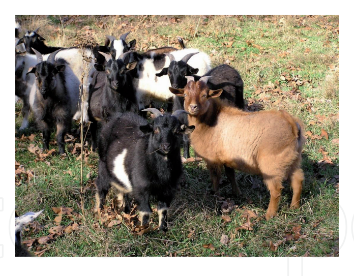
Figure 5. These young Myotonic bucklings show the stout conformation and heavy muscling typical of the breed, as well as a portion of the range of colors.