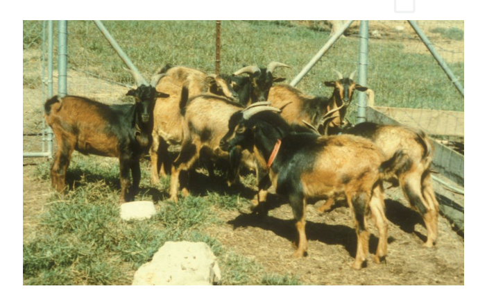
Figure 7. San Clemente goats generally come in variations on a single color, although other variations do occur occasionally and were also typical of goats originally from the island.

The barrier islands off of South Carolina and North Carolina include a few with small populations of feral goats. The few of these with decent histories of isolation are generally a phenotype that fits within the Spanish goat, and these are included in the conservation efforts for that breed. A few others show influences of Nubian or other recent introductions, and are therefore not included as conservation priorities.