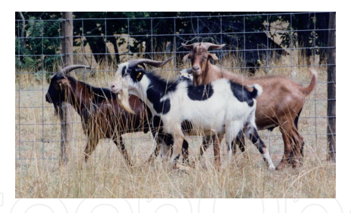
Figure 3. These are young Spanish bucks from different bloodlines showing the consistent horn and ear carriage of the breed.

fit into the framework of a landrace population that had a specific foundation followed by long-term genetic isolation and exposure to a selection environment imposed both by natural influences as well as human owners. This resource, in both the southwest and southeast, continued as a local resource that was not much changed due to geographic and cultural isolation. The only real threat to its integrity for most of its history was Angora goats in Texas, and the final fiber and general phenotype is so different in that case that there was little incentive for such crossing.