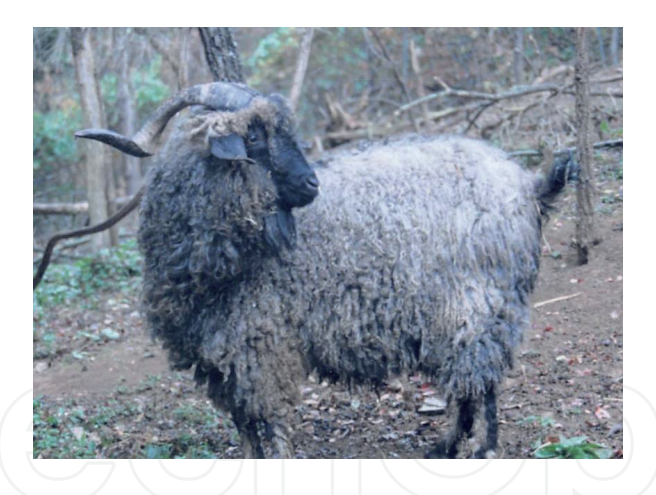
Figure 2. The Navajo Angora goat is often colored, and has different fleece and horn structure than the more typical commercial modern Angora type.

interest in organizing the breeding and recognition of this type which has generally persisted outside of the registries. In the early days of the formation of the Colored Angora Goat Breeders' Association most of the goats accepted into the registry were of the Navajo type, which often includes colored goats. However, in this Association the past decades have seen increasing use of the colored goats that rarely segregate from registered white Angora herds and tend to be of the more modern type. This breeding strategy has changed the overall breed type within the colored Angoras from the original Navajo type towards the more modern type. The colored goats have become increasingly fine-fleeced, which is the goal for most breeders of modern Angoras. As a reaction to this the breeders that prefer the Navajo type are beginning to organize breeding programs targeting this archaic type. There are no current estimates on population size for this type of Angora goat, but it is likely to number no more than 1000 head ( Figure 2 ).