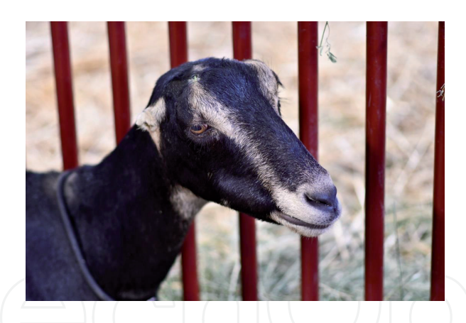
Figure 1. The American Lamancha is characterized by short ears.

is a grade goat, although in most cases one that has very little breeding external to the imported lines. American goats, regardless of how small that outside influence is, can never be moved over into the purebred section. The case of the American Lamancha is therefore slightly different, because it is a breed that was formed in the USA, and as a result the only herdbook section is "American." Therefore upgraded goats are fully included into the registry in this single section, and can participate fully within the breed.