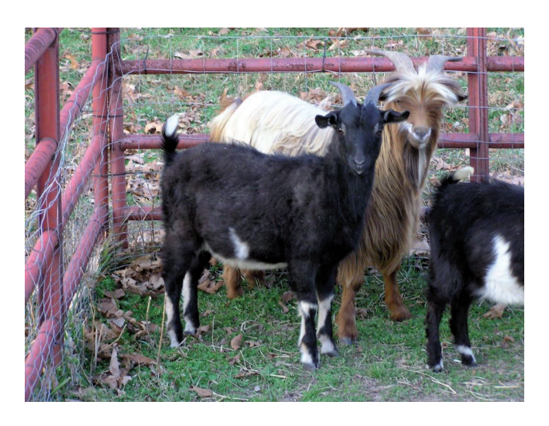
Figure 6. Hair length and quality varies in the Myotonic breed.

Census figures from 2015 include 3500 new registrations. When mature stock is also considered, the final numbers of goats within the breed are likely to be around 10,000 or more. This was a rare breed 30 years ago, but has now become more popular and these population figures indicate that the breed is now secure from threats of extinction. Only a few large herds exist (100 head or more), and consequently the breed is exposed to many different breeding programs, each with a different selection goal. This helps to maintain diversity within the breed ( Figures 5 and 6 ).