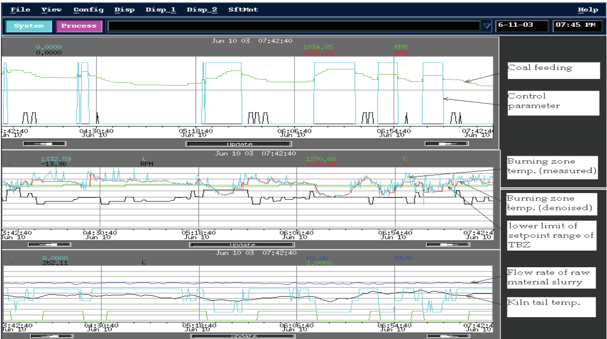
Fig. 4. The setpoint of burning zone temperature is properly adjusted after learning