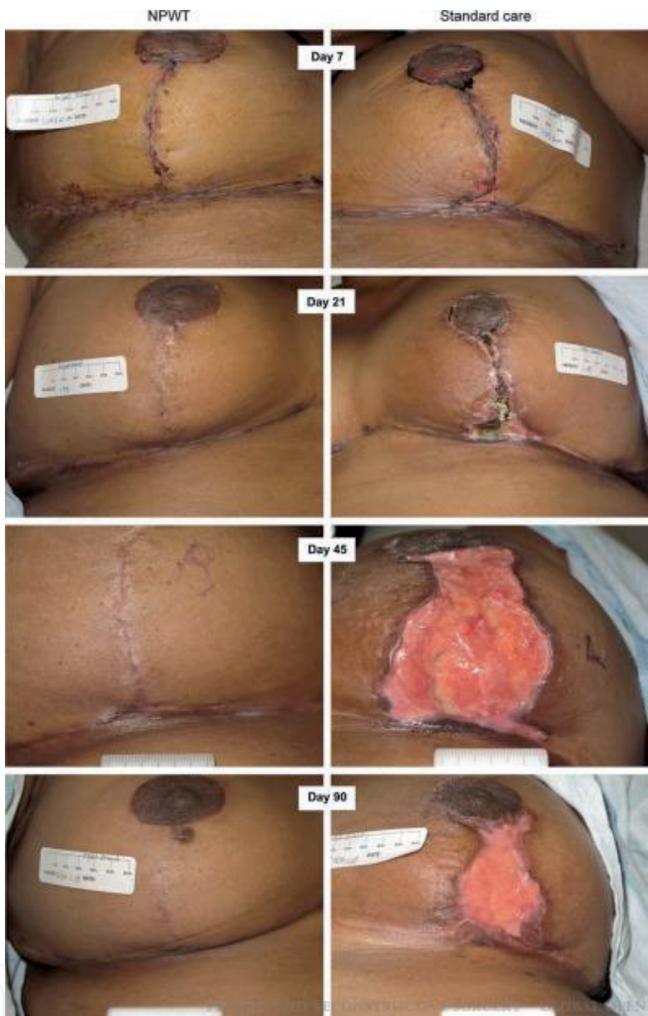
Figure 2. Progression of incisions in patient treated with iNPWT and standard wound care after bilateral reduction mammoplasty. Wound complications and dehiscence are reduced with iNPWT (reprinted with permission from Ref. [60]).

Risk factors that increase the risk of sternal wound infections include smoking, diabetes, increasing number of grafts, peripheral vascular disease, chronic pulmonary disease, obesity, increased duration of mechanical ventilation, preoperative malnutrition, and harvesting of bilateral internal mammary arteries [67].