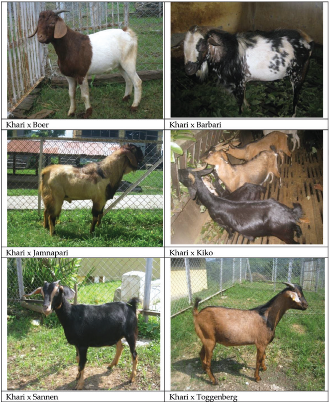
Figure 3. Crossbred goats at Goat Research Station, Bandipur (photo courtesy: Goat Research Station, Bandipur, Nepal).