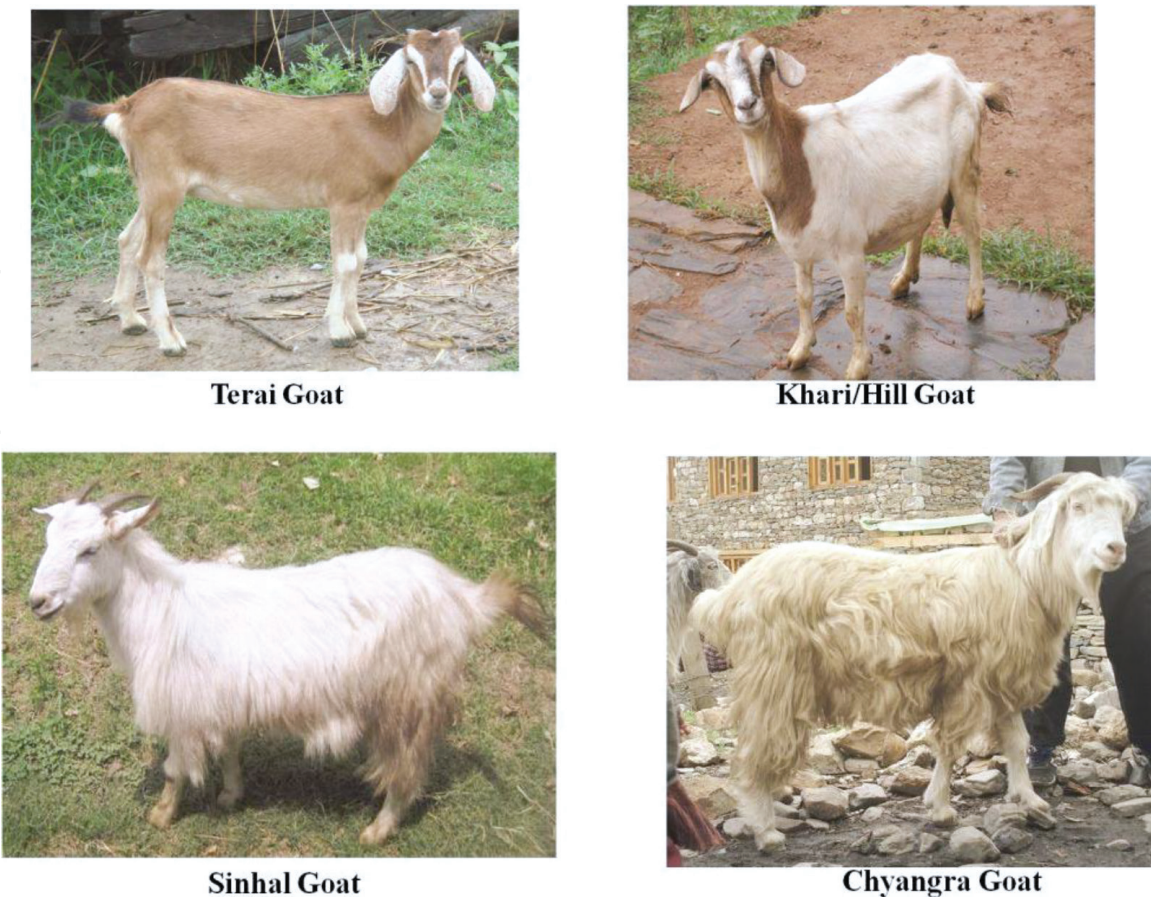
Figure 1. Indigenous goat breeds of Nepal (photo courtesy: Animal Breeding Division, NARC).

Terai goats are found in the Terai region and inner valleys (tropical and subtropical climate) of the country and are reared as the meat-type animals [9]. They have been characterized at phenotypic, chromosomal, and mitochondrial levels [4, 12, 15]. They are heavily crossed with Indian breeds including Jamnapari, Barbari, Ajmeri/Sirohi, and Beetal; and thus population of pure Terai goats is at risk from the conservation point of view. This breed constitutes 27% [16] or less than that of the total goat