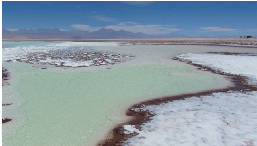
Figure 3. Laguna Tebenquiche, the largest water body in Salar de Atacama harbors rich prokaryotic diversity varying spatiotemporally and coexisting with the brine shrimp Artemia franciscana .

de Ascotán, and also in Tebenquiche lagoon, finding high microbial diversity in Tebenquiche and Salar de Ascotán, whereas diversity decreased in Salar de Huasco. Most of the 16S rRNA gene sequences corresponded to the following genera (Flavobacteriaceae): Psychroflexus , Gillisia , Maribacter , Muricauda , Flavobacterium , and Salegentibacter . The most abundant phylotype was related to Psychroflexus spp. A study of hypersaline wetlands in salars of the Altiplano at a higher altitude than those previously mentioned [36, 37], including Salar de Huasco and Salar de Ascotán, also showed significant differences in their microbial community attributed to habitat type and physicochemical properties of the lagoons. Bacteroidetes and Proteobacteria predominated with a smaller contribution of Firmicutes, Actinobacteria, Planctomycetes, Verrucomicrobia, Chloroflexi, Cyanobacteria, Acidobacteria, Deinococcus-Thermus .