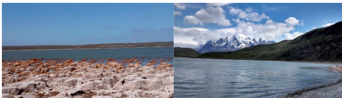
Figure 2. Cisnes (left) and Amarga lagoons in the Chilean Patagonia, the former was declared a national monument to protect waterbird diversity. Both are unique hypersaline ecosystems in an area where freshwater lakes of glacier origin abound. Bacterial diversity and the brine shrimp Artemia persimilis coexist, a subsample of wild bacteria diversity represented in the Artemia -gut microbiota.