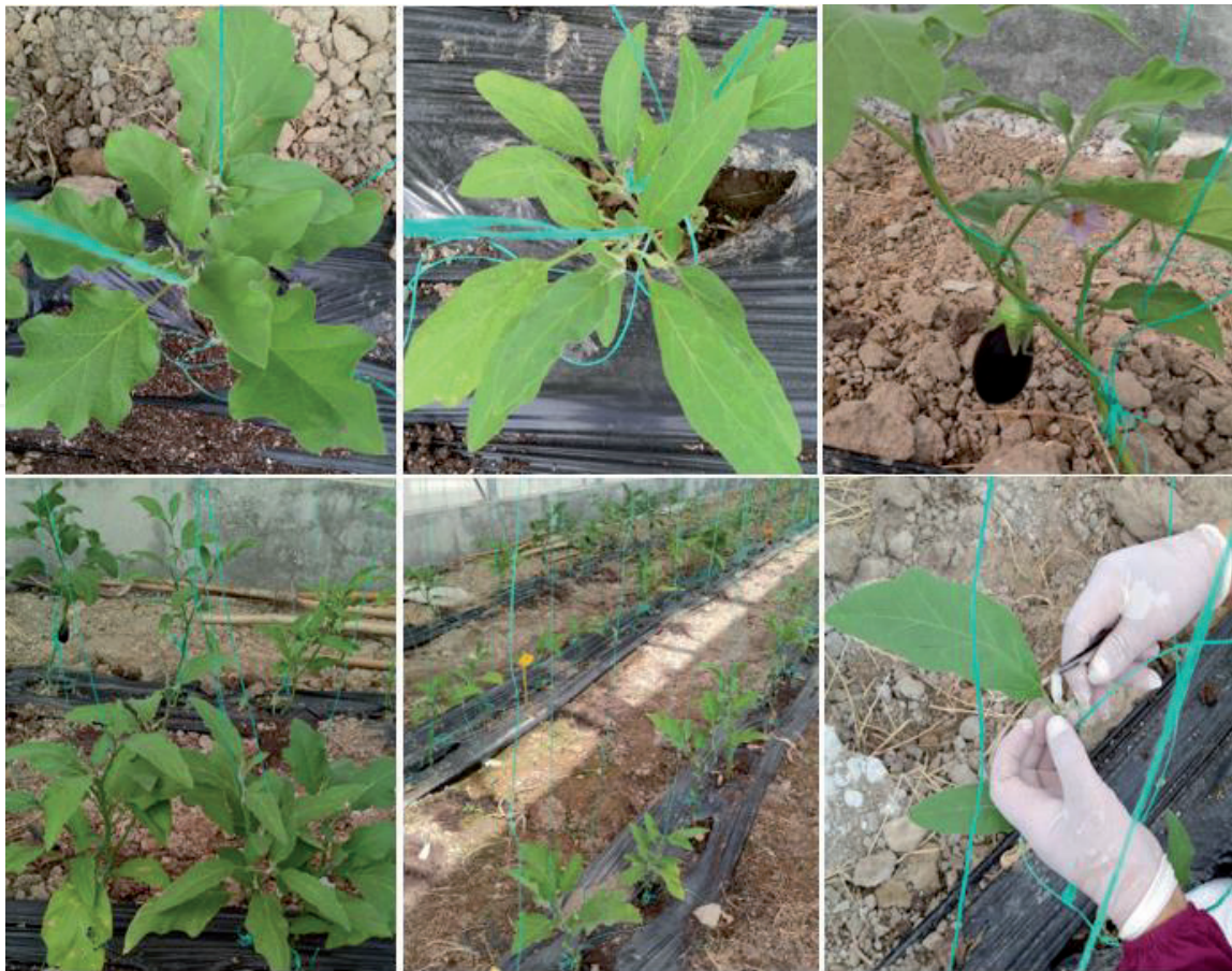
Figure 8. Plants obtained from anther culture at the different ploidy levels. Application of chromosome doubling in the greenhouse.