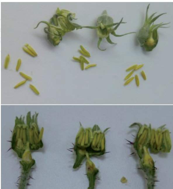
Figure 2. Suitable bud morphology for eggplant anther culture.