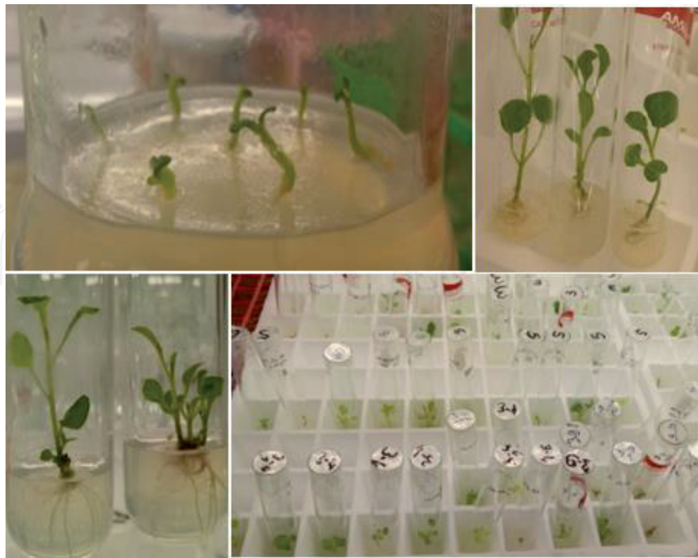
Figure 6. In vitro regeneration and development of haploid plantlets.