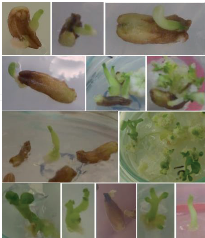
Figure 5. Direct androgenesis and haploid embryo formation.