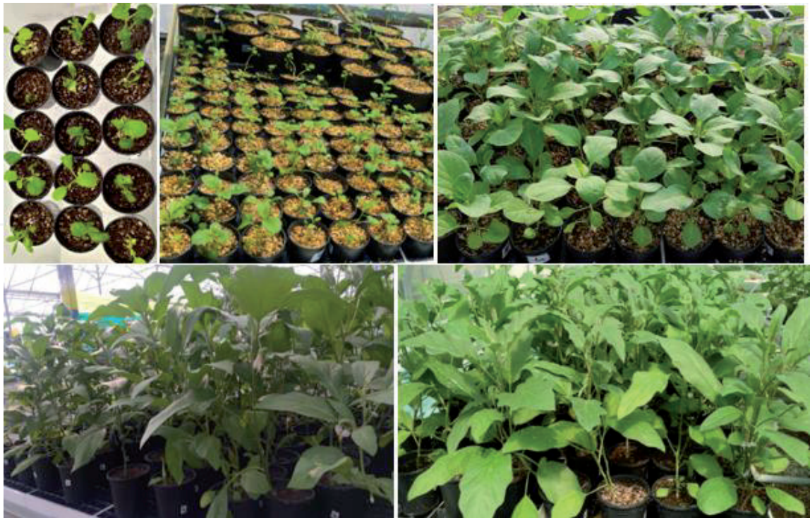
Figure 7. Acclimatization of in vitro regenerated plantlets.