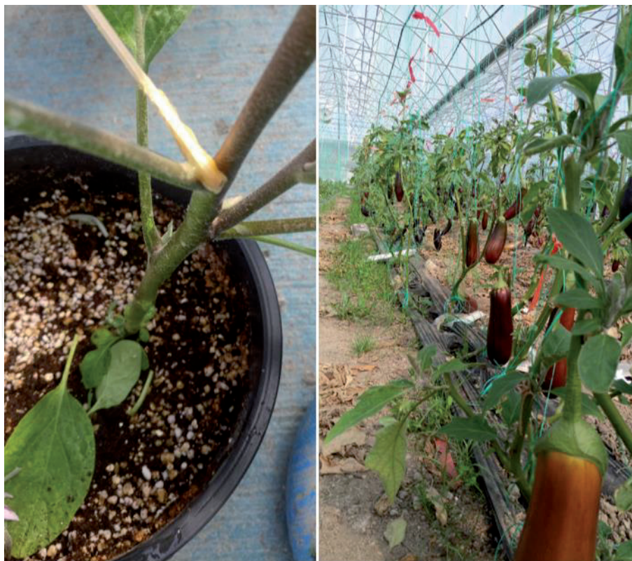
Figure 9. Colchicine treatment with lanolin. Fruits on the DH branches.