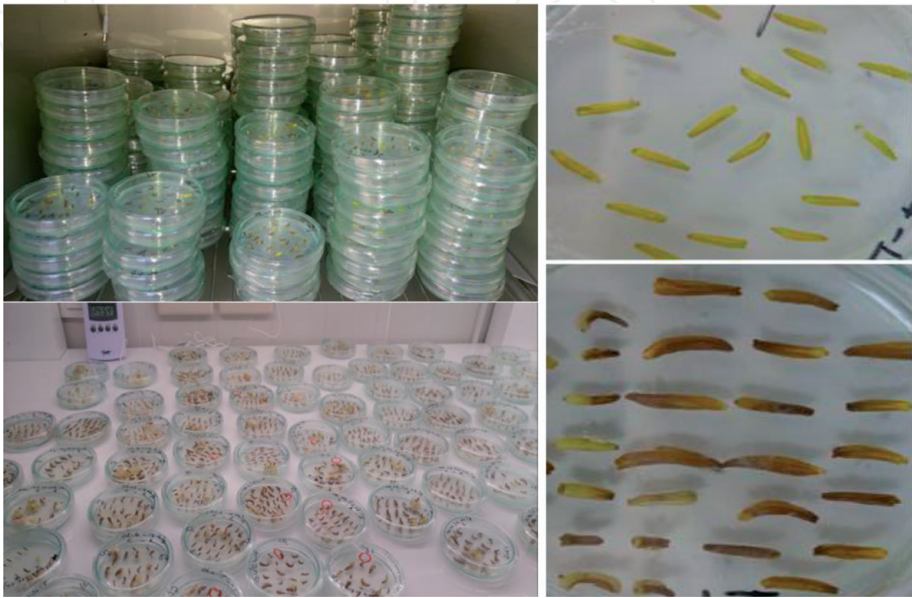
Figure 4. Pretreatments (temperature applications) and incubation of cultures.