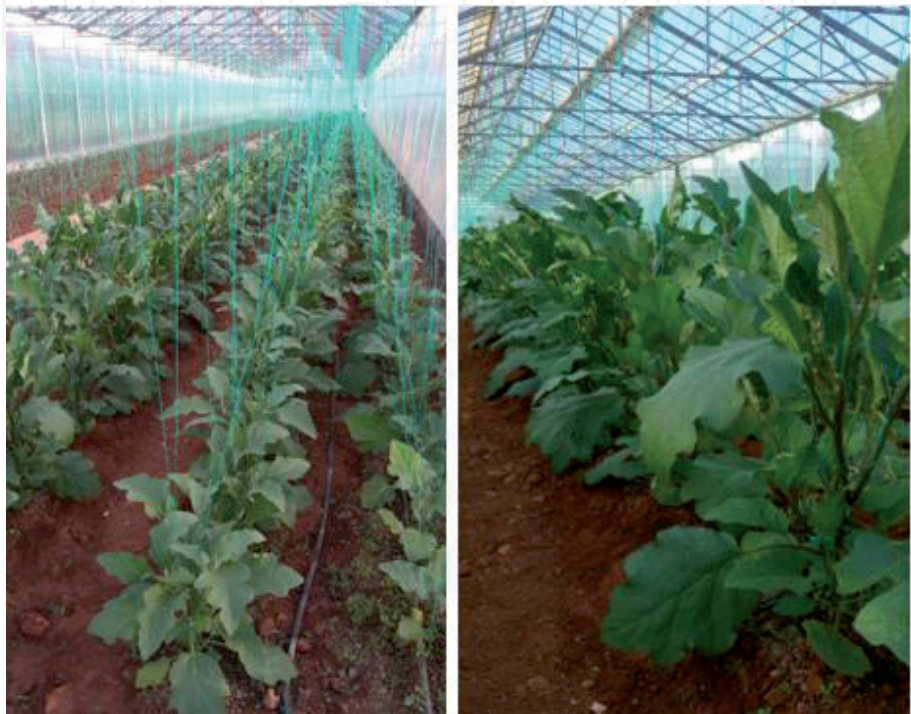
Figure 1. Donor plant growing under biotic and abiotic stress-free conditions.

The stages of an eggplant anther culture protocol (applied in TUBITAK TEYDEB Project No. 68989 conducted by Antalya Tarim Co. R&D Center) which can be used effectively and practically in breeding studies were briefly summarized in Figures 1–9 .