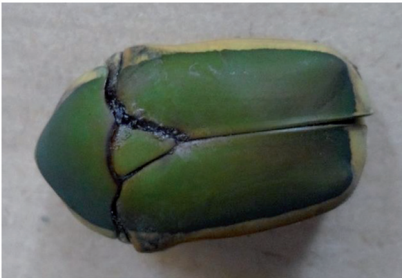
Figure 3. Adult dried cetonia (Cetonia aurata) in Cameroon Western highlands.