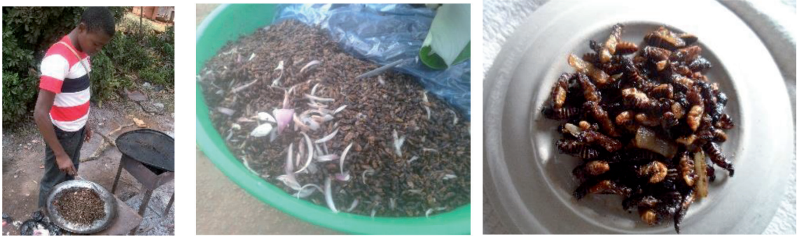
Figure 2. Processing of termites (Macrotermes sp.) and selling packages in Cameroon.