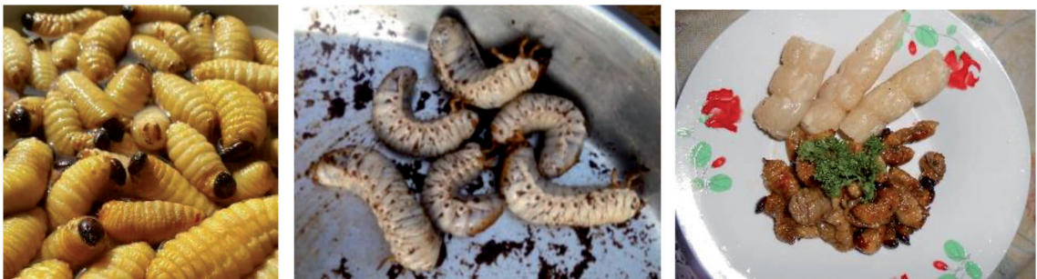
Figure 4. Palm weevil grubs (Rynchophorus sp.) and a dish made with in Cameroon.