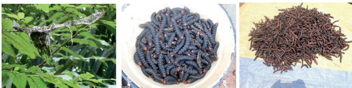
Figure 1. Edible caterpillar nest and heap of fresh and dried ones ( Imbrasia sp.).

The acridians or grasshoppers (Orthoptera), Locusta migratoria (also Schistocerca gregaria ) known as migratory locusts are commonly exploited in drier regions of Cameroon ( Figure 5 ), whereas Ruspolia differens , Tettigonia viridissima and Zonocerus variegatus are exploited in humid environments in southern Cameroon [10, 14]. Zonocerus sp. is treated with care because of toxins if not well prepared before ingestion.