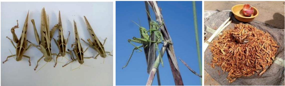
Figure 5. Migratory locusts (greyish and greenish) and dried in North Cameroon.