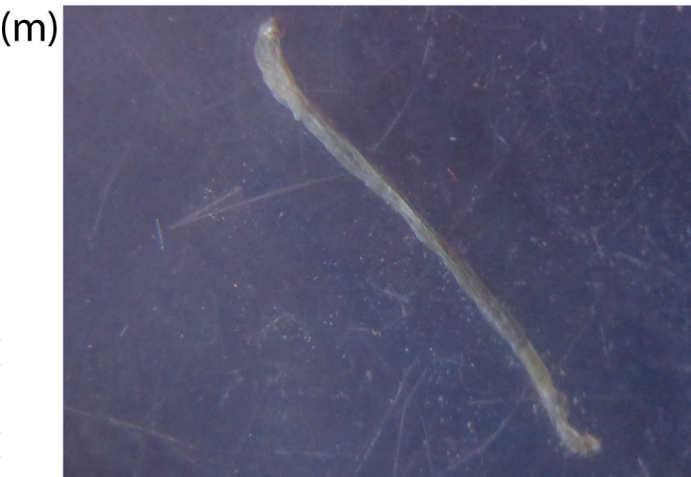
Figure A2. (K–M) Insect species encountered at Ijala-Ikeren community. (K) Aquarius remigis ; (L) Formica sp; (M) Chironomus sp.