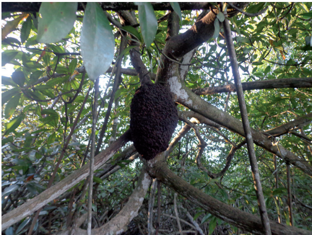
Figure 2. An ant hive hanging on a mangrove plant in Ijala-Ikeren mangrove swamp where insect collection was made.