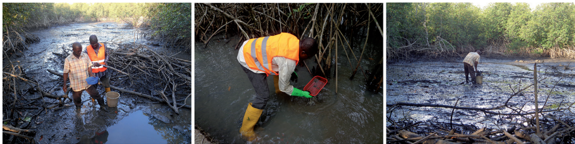
Figure 3. Insect collection from under woods, logs and fallen leaves in Ijala-Ikeren mangrove.

species, the evenness of communities across the sampling region or the dominant species. Abundance is the kind of diversity measures that has inclusively been considered as equivalent to biodiversity per se [29] and referred to the sum of individuals in area. However, Simpson diversity index (D) is nearly the most tractable and statistically useful calculation [30]: