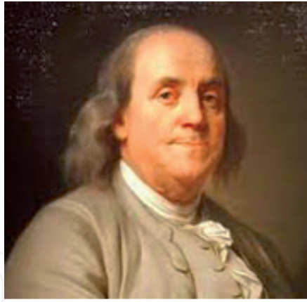
A self-taught man