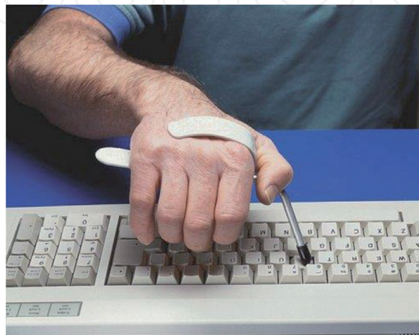
Figure 2. Use of typing aid for improving typing accuracy for people with limited motor skills of the hands and fingers [12].

Construction of a device and computer system needs to take into consideration on how users interact with it. While performing their task using the engineered product as utility, it is preferred to support users to interact with the engineered