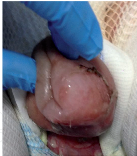
Figure 2. Red-violet lesion in the genital organ.