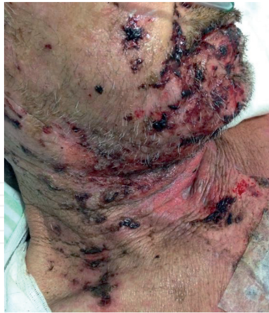
Figure 4. Confluent erosions with hematic crusts in the head and neck region.

Already erythema multiforme shows prodromal symptoms such as fever and myalgia before the appearance of lesions on the mucosal and skin. Their skin lesions change in feature according to the course of the disease and resemble insect bites or hives that result in the well-known targetoid lesions that are common in this disease. Although cases of necrosis and blisters occur in the center of the lesions, this disease shows less aggression and fewer blisters and ulcers with hematic crusts than the patients affected by PNP [42].