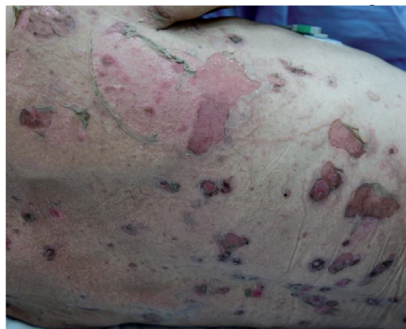
Figure 3. Extensive erosions and blisters in the dorsal region.

About 70% of the patients present conjunctival lesions such as bilateral bulbar conjunctival hyperemia, diffuse papillary tarsal conjunctival reactions, conjunctival epithelium desquamation, forniceal shortening, painful ocular irritation, poor vision, conjunctival and corneal erosions, and pseudomembranous conjunctivitis [2, 46, 47].