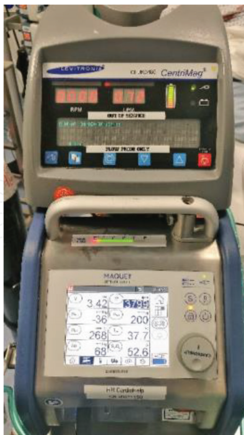
Figure 4. Continuous DPC flow monitoring.

posterior tibial artery and when not palpable a hand-held ultrasound Doppler should be utilised to confirm the flow. The flow may be graded for documentation as palpable-strong pulsatile, palpable- weak pulsatile, doppler- pulsatile, doppler- continuous flow and absent flow. Hourly recording of continuously monitored variables namely DPC flow, NIRS rSO_2 are necessary to establish trends and detect limb ischemia before it is clinically apparent. Numbers and signs that may be missed during continuous monitoring can be caught in a vigilant hourly survey. Ischemia in toes is seen not uncommon, even in the presence of well-maintained DPC flow due to peripheral micro thromboembolization and/or vasospasm due to peripheral shut down or high dose vasopressors.