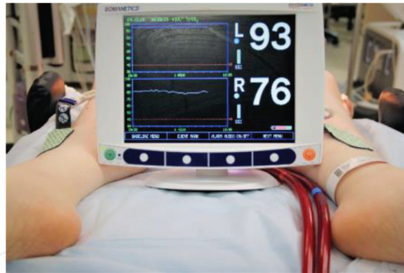
Figure 3. NIRS continuous monitoring.

continuously, representing adequacy of tissue oxygenation. It should be applied as soon as ECLS is started. The rSO_2 of the cannulated limb is compared with that of the opposite limb as well as with the baseline rSO_2 providing live evidence of a drop in limb perfusion ( Figure 3 ). A reduction in rSO_2 values in the cannulated limb to less than 40 or more than 25% from baseline suggest inadequate limb perfusion and mandates urgent intervention [30, 31]. Technical glitches, however, like improper sensor pads attachments should be addressed before attempting to improve distal limb perfusion. Dong and colleagues utilised the NIRS successfully in a group of ECLS patients to detect and successfully treat limb ischemia with DPC in all patients having NIRS whereas 13.9% of the cohort not monitored required a fasciotomy [31]. Indeed, NIRS may reliably detect limb ischemia before it becomes clinically evident [31, 32]. Lamb et al. suggest continuous monitoring of limb utilising NIRS and evaluation of pedal doppler signals in case of a drop in baseline NIRS values to ensure adequate distal limb perfusion [33]. If available, we suggest that NIRS should be part of the protocol for peripheral ECLS.