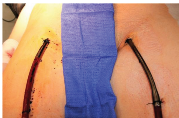
Figure 1. Percutaneous cannulation.

For this, CPB can be converted directly to central ECLS, using the established cannulation or to peripheral ECLS. Peripheral ECLS allows the chest to be fully closed and no re-opening is needed for explantation of the ECLS system or for cannula-site bleeding especially in these patients on anti-coagulation therapy. With the patient stable on CPB it is safe and easy to perform a cut down to the groin vessels and placement of the cannulas under direct vision ( Figure 2 ). If necessary, DPC can be introduced simultaneously. If the myocardial function is somewhat preserved, ECLS flows should be kept at a level allowing for blood flow through the heart to maintain left ventricular ejection in order to prevent its dilatation, stasis of