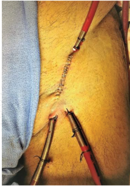
Figure 2. Open cut-down cannulation.

blood and possible atrial and ventricular thrombus formation. In severe myocardial injury, the heart can be rested with full ECLS flow without ejection. In this case, the need for ventricular decompression should be discussed. With biological no-flow, a case of high vasopressor requirement or expected longer duration of support, the DPC can introduced at the same time.