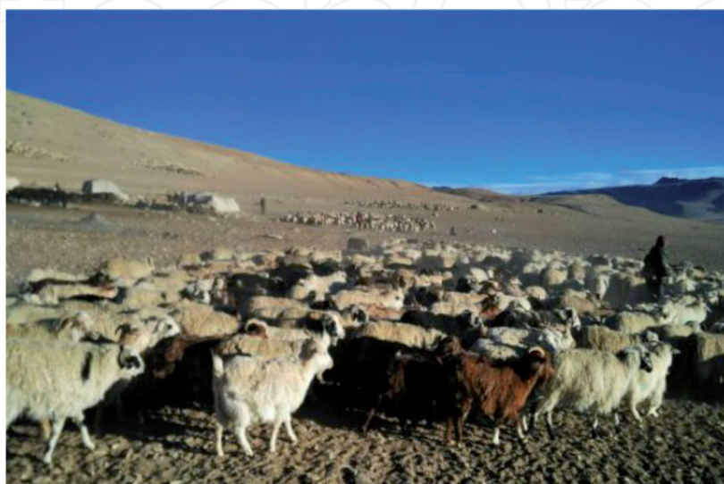
Figure 1. Pashmina goats leaving for grazing.

This goat ( Capra hircus ), a mammal belonging to subfamily Caprinae and family Bovidae produces fine, soft and much straighter double fleece of hair called guard hair. These goats are of medium type, their height ranges from 60 to 80 cm. The average weight of male and female pashmina goats is about 45 and 35 kg respectively. They possess wide horns; have blocky builds, and refined features. Pashmina goats occur in different colours. White tends to be dominant but black, brown, red, cream, grey and badger faced are very common. These goats tend to be alert and cautious, rather than docile and placid. These traits are largely due to their feral ancestry, relatively only a few generations back ( Figure 1 ).