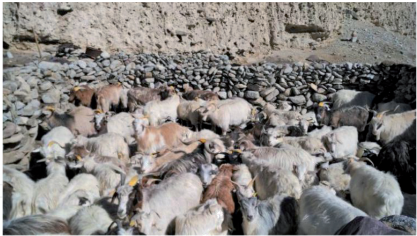
Figure 3. Pashmina goat paddock fenced with stones.

pashmina goats found in the Ladakh region of Jammu and Kashmir. Pashmina yield by bucks is lower and a relatively higher yield by does. These goats are very poor in milk production. On an average a female goat can produce 200–500 ml daily. Pashmina yield per annum in Changthangi goats is about 80 g at first clip, 150 g at second clip, 230 g at third clip, 200 g at fourth clip and 210 g at fifth clip. The length of fibre is observed as higher in males than females [10].