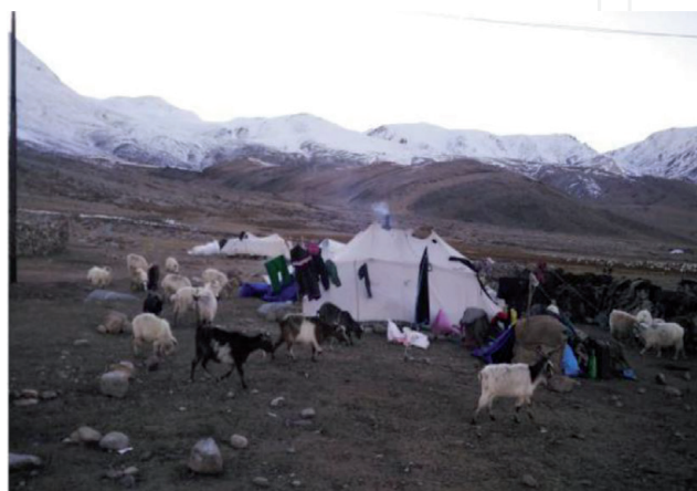
Figure 2. Outer view of Rebo.

Of total 15,000 metric tons pashmina wool produced in the world, China's share is 70% followed by Mongolia at 20%. India's yield constitutes a mere 1% of the world's pashmina production. Of this, 40 tones are derived from the around 1.6 lakh