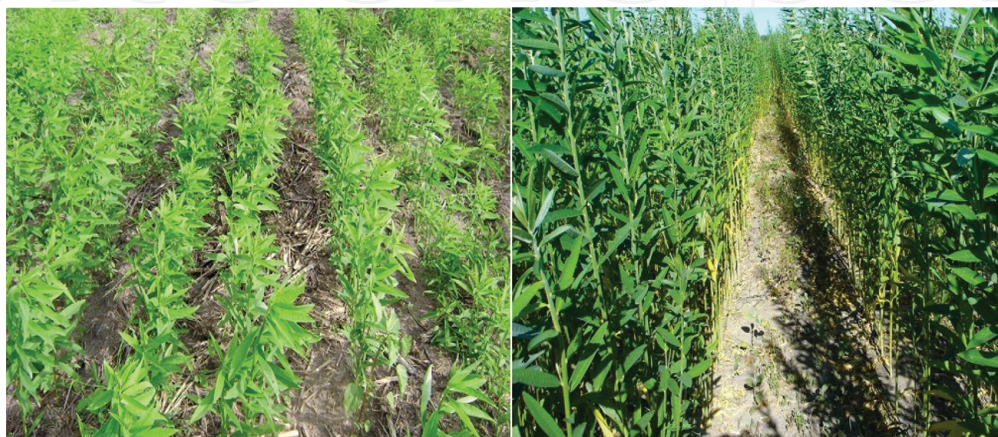
Figure 3. Crotalaria juncea at the early growth stage and its allelopathic effect on weeds confirmed by the absence of weeds between the planting rows (photo on the right).

Due to the sensitivity of Crotalaria juncea to nictoperiod, the delay in sowing results in early flowering. The authors of this chapter have observed in crops of Crotalaria juncea of the Zona da Mata region that plants are able to receive the stimulus for floral induction around 40 days after emergence. Thus, for sowing times