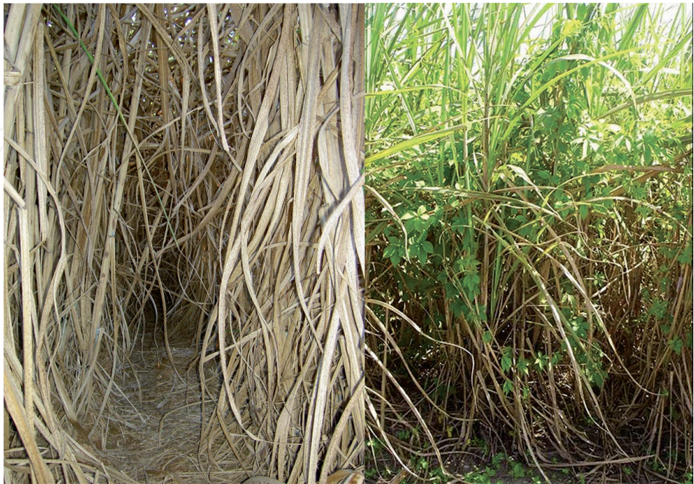
Figure 1. Contrast between a sugarcane plantation with high yields and excellent weed control, and a plantation with low yields and poor weed control.

Table 2 shows that to feed 25 cows for 365 days (20 kg of natural matter per cow/day), an area of 1.63 ha of a sugarcane plantation with high yield in the plant-cane cycle and 10% decrease in subsequent cycles would be necessary (Scenario 1). On the other hand, an area of about 3.3 ha would be needed for a sugarcane plantation with medium yield in the plant-cane cycle and large decreases in subsequent cycles (Scenario 14). In sugarcane plantations with yields of less than 60 tons of natural matter per ha (about 50 tons of industrializable culms), in addition to decreasing the use of land and labor resources, chemical weed control is generally inefficient, as the crop does not completely cover (shade) the soil, allowing the emergence and growth of invasive species ( Figure 1 ). Also, in cases where sugarcane is cut by hand, the worker will be more exposed to snakes and scorpions.