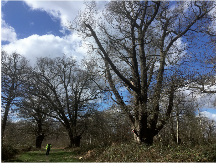
Figure 1. Lapsed Quercus sp. pollards at Ashtead common.

in the parks by a deer-proof boundary, the most characteristic being a ‘park pale’ or palisade fence of cleft oak, very expensive to build and maintain. The park pale could also be a wall, but this was less likely in South East England. Parks varied in size and, because of their cost, were the preserve of rich people and those that could afford such a status symbol. Inside the park pale, the land was grazed, but it could range between dense woodland and completely open areas. Typically, much of the area was grassland with scattered trees, sometimes pollarded, but this was not universal.