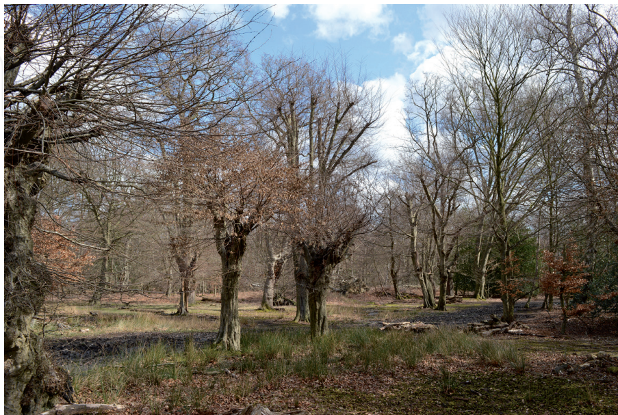
Figure 8. Example of a group of small pollarded trees at Epping Forest, where pollarding may have been on an industrial scale.

Reasons for the extensive losses include agricultural intensification, urbanisation and conversion to commercial forestry but also abandonment. Once the tree products were no longer valued, they stopped becoming relevant to the local people.