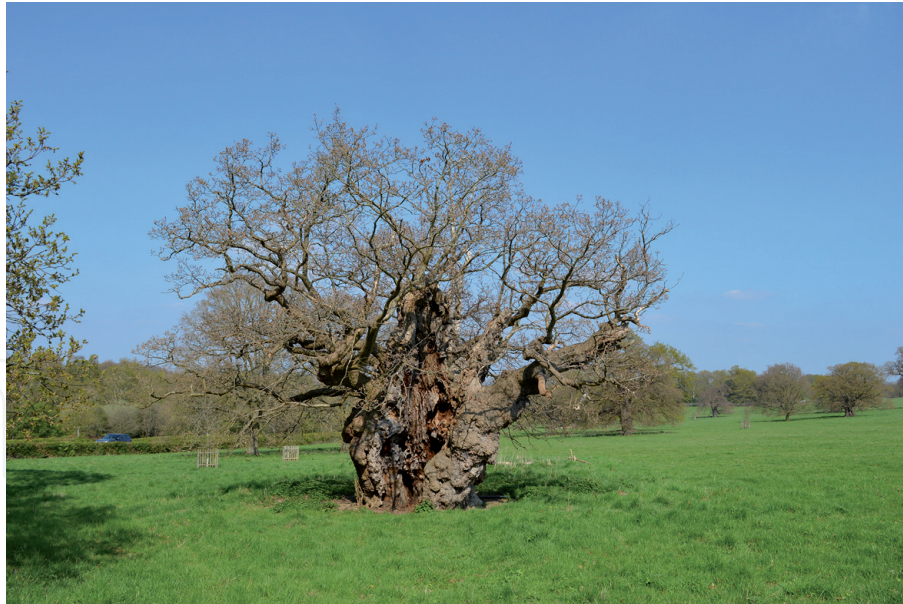
Figure 2. Old Quercus sp. tree at Windsor Great Park.

but included a wide range of different land uses and sometimes even towns. Later in time the term Forest was used more to describe that part of the land that was not woodland, farmland or built upon [12]. This could be open grassland or heathland, but much was also probably wood pasture. A Royal Forest was an area where the king had rights, including the right to hunt. There was often a great deal of administration associated with the Forest, and many people were employed to supervise the interest of the Crown (royalty) in the land. These administrators gained rights through their positions, and these included rights to pasture animals, take wood and timber, etc. The land was not necessarily owned by the Crown, but the owners were prohibited from doing certain things with their own land, and this frequently included cutting down their own trees [12]. Chases are equivalent to Forests but were privately owned not part of the Crown land. At one time Forests and chases covered approximately one fifth of England [12].