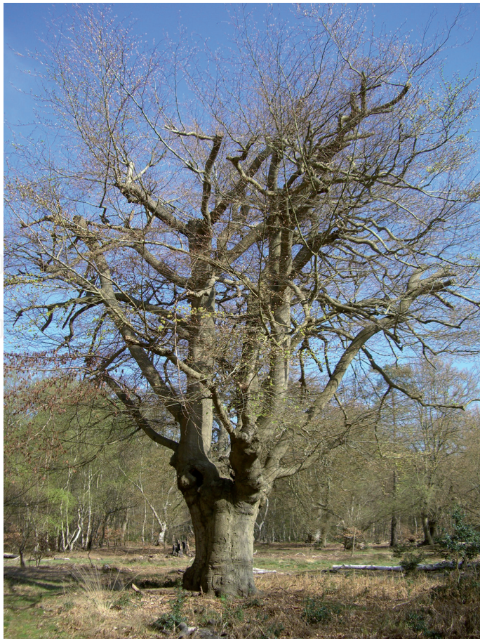
Figure 13. Gradual reduction on a lapsed Fagus sylvatica pollard at Burnham Beeches.