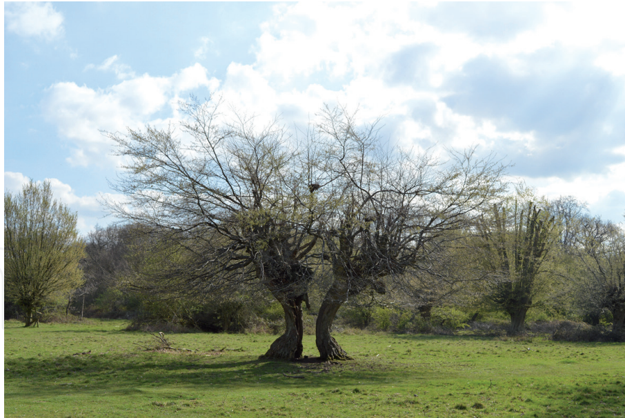
Figure 3. Carpinus betulus pollards at Hatfield Forest.

woodland. This affected over 20% of all parishes in England [12]. Some enclosure was piecemeal and illegal, but Acts of Parliament made the process legal from 1700 onwards. Whenever and wherever strip fields or common grazing land was enclosed, the land was divided up into fields, bounded by hedges, in an ad hoc manner in old field systems, more rigidly planned and planted under legal inclosure.