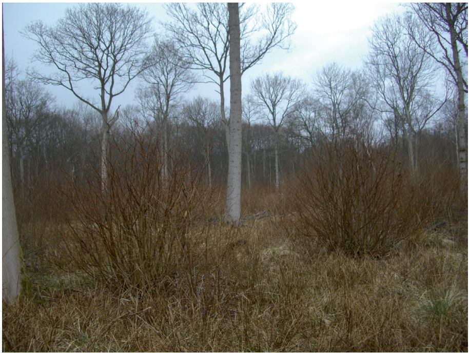
Figure 7. Tilia and Corylus coppice in a wood with standards in a Lincolnshire wood.

of them and allow the coppice to grow, but sometimes they were let in towards the end of the cutting cycle, and at Hatfield Forest this was part of the organisation of the whole Forest [20].