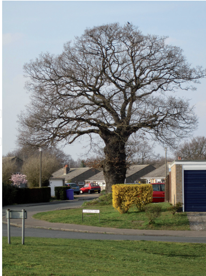
Figure 10. Old Quercus sp. tree that was part of a wood pasture on a wooded common but is now within a housing estate. Aspal close, Suffolk.

generation of workers to talk to. As the work was once considered to be so commonplace, details were not generally written down, so it is necessary to (re)learn from other places, try to interpret from the structure of the trees or discover again from the beginning. In addition, the lapse in cutting of the trees means that they are now out of a regular pollarding cycle, something that our ancestors did not have to deal with, so we have to learn new skills to manage these trees. The consequences of our actions may take many years to become evident, so this is not a process that should be hurried.