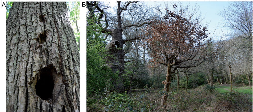
Figure 16. (A) Woodpecker hole created with a chainsaw at the bottom and holes created by a woodpecker above it, a few years after the work was done. (B) Newly created Quercus pollard.

In agricultural systems where scattered trees in the hedges are acting as a different form of wood pasture, a big problem in the past has been the removal of hedges to make larger fields allowing easier cultivation with larger machinery. Any trees in the hedges were generally lost too and were rarely incorporated into the fields. Hedges are now protected in England, and there are grants for replanting and managing them. In highly productive areas, this has been an important way to increase the density of trees in the landscape along with the scrub species in the hedges.