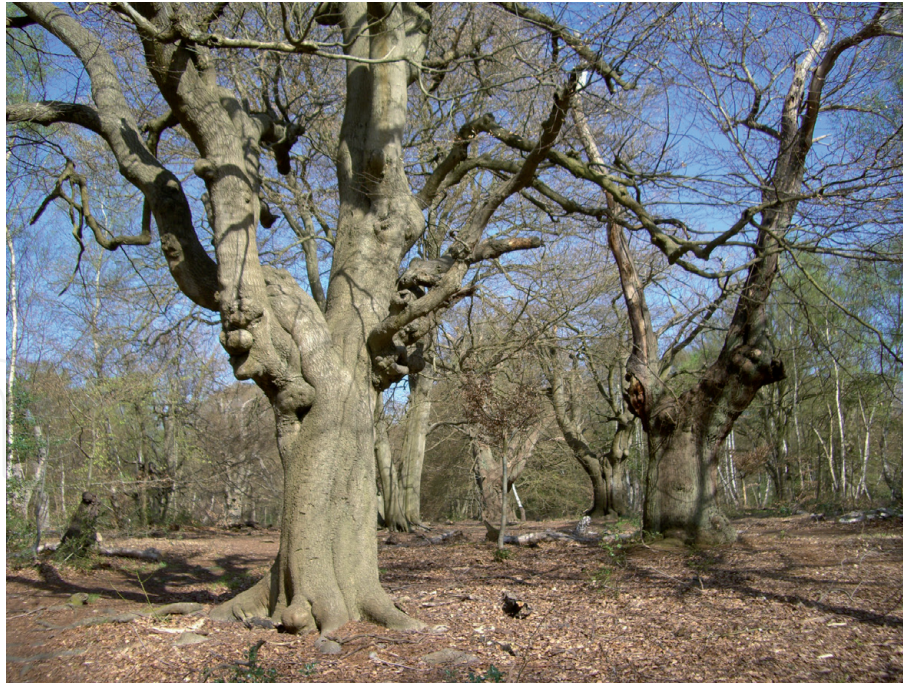
Figure 5. Lapsed Fagus sylvatica pollards at Burnham Beeches.