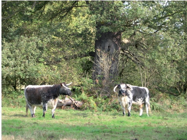
Figure 12. Traditional English longhorn cattle grazing a wood pasture at Cranborne chase, Windsor. These cattle are good at browsing and thriving on poor quality vegetation.

trees that grow under and through the canopy of the old trees, ensuring there is also a ring of a few metres around the canopy that is open ( Figure 11 ). A few years later, the next phase can create a larger ring around the old tree, ensuring that the tree is not too exposed to the sun and wind. Doing this work by focusing on trees in groups is more effective and leads to better results [32] than only on individual trees.