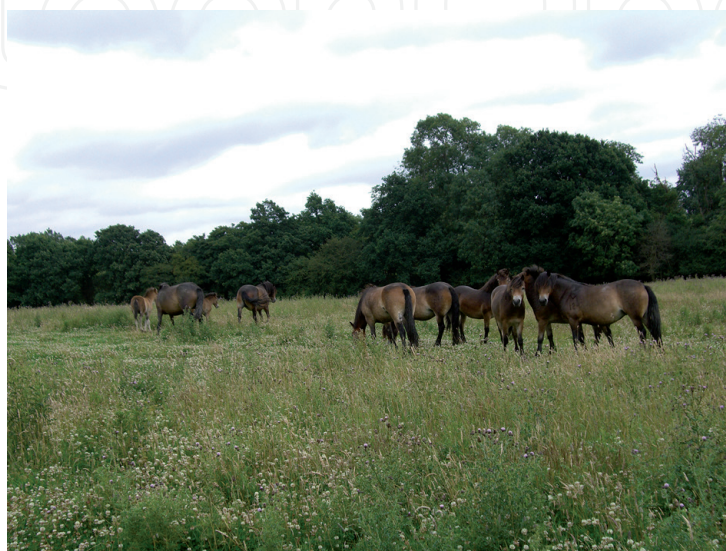
Figure 15. Exmoor ponies used as part of the rewilding project at Knepp Castle estate.

Case study: The Knepp Estate in Sussex took the decision in 2001 to stop traditional farming and remove all the internal fences and boundaries. Several different species of livestock ( Dama dama , longhorn cattle, Tamworth pigs and Exmoor ponies, Figure 15 ) were introduced and allowed to roam freely. This allows the animals to decide where they want to feed, wallow, calve and sleep. The idea builds on the concepts and ideas of Frans Vera and his book Grazing Ecology and Forest History in 2000 [6]. The animals are allowed to drive the system, and the result so far after some 20 years is a dynamic wood pasture system, where biodiversity is thriving [37].