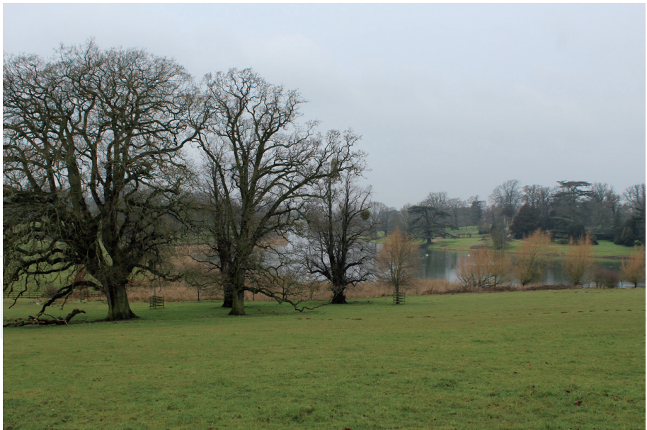
Figure 6. Open-grown trees in a formal landscape at Burghley Park.