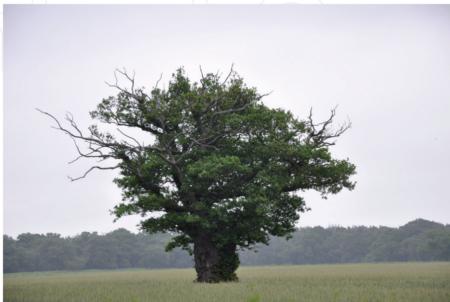
Figure 9. Old Quercus sp. tree that has been ploughed close to it in order to cultivate for arable crops.

People are nowadays much less connected to the land, and many of the skills that were previously passed down through the generations have been lost. Farming methods have changed to be more mechanised, and the manual skills are no longer needed. There is really no first-hand knowledge of how the trees were pollarded, and most were last cut over 100 years ago, so there is no older