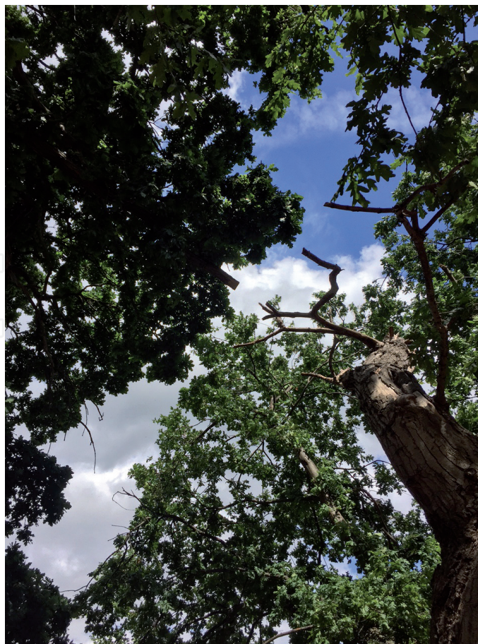
Figure 11. View looking up from a tree that has been halo cleared to show the gap between its foliage and that of the surrounding trees—The first step in giving an old tree more light (Ashtead common).

For many wood pastures, the restoration and reintroduction of grazing animals is the most important management option for conserving these valuable habitats. This is potentially more important than any work which may be required on the individual trees. Restoring wood pastures needs to be carried out in stages, to make sure that the old trees are not suddenly shocked by fast changes to their environment [3, 4]. Removing competing trees should first involve removing the young