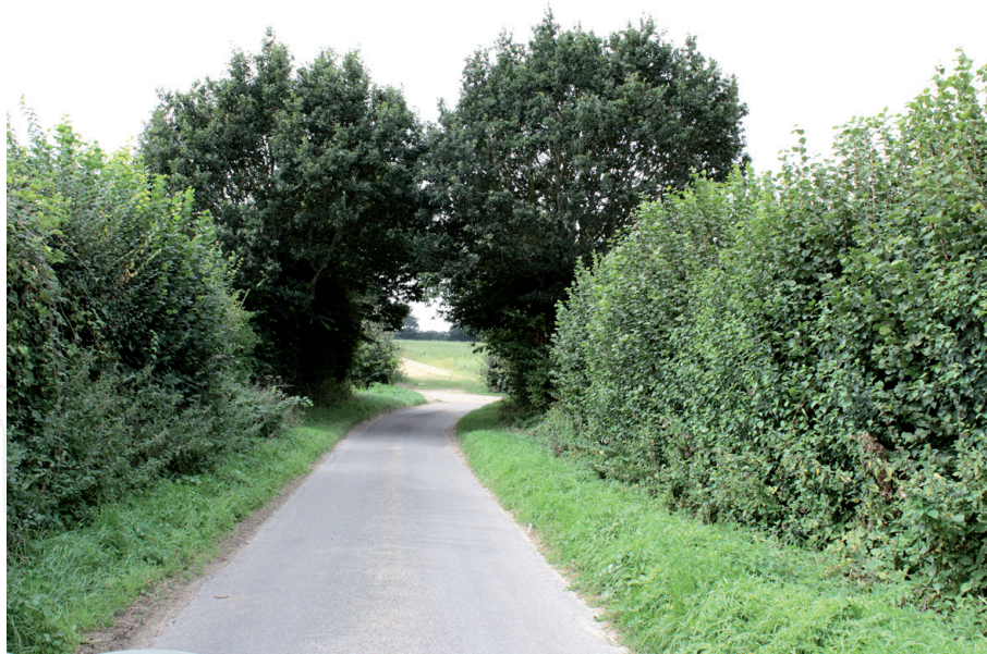
Figure 4. Pollarded Quercus sp. trees in an ancient hedge at Goswold hall.

almost no trees. Thus, ‘wood pasture’ has not acquired a separate identity in the UK but was characteristic of several different forms of land management. It was also potentially difficult to delineate because it blended seamlessly into open habitats like pasture or places with dense tree cover like woodlands within the same park or Forest. Even on a common, there could be very open areas with almost no trees and contrasting places where the density of trees or pollards was so great that they were in effect like woodlands.