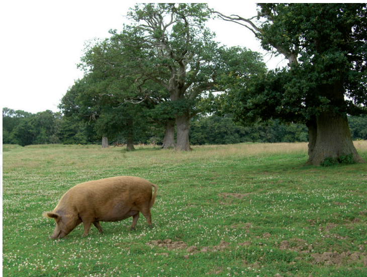
Figure 14. Tamworth pig and deer at Knepp Castle estate. Pork, ham and venison contribute income for the estate.

only accessible on high conservation value and/or large sites, and thus smaller areas may be less well supported. In addition, the administrative burden and obligatory requirements of the scheme mean that it is not attractive to all landowners.