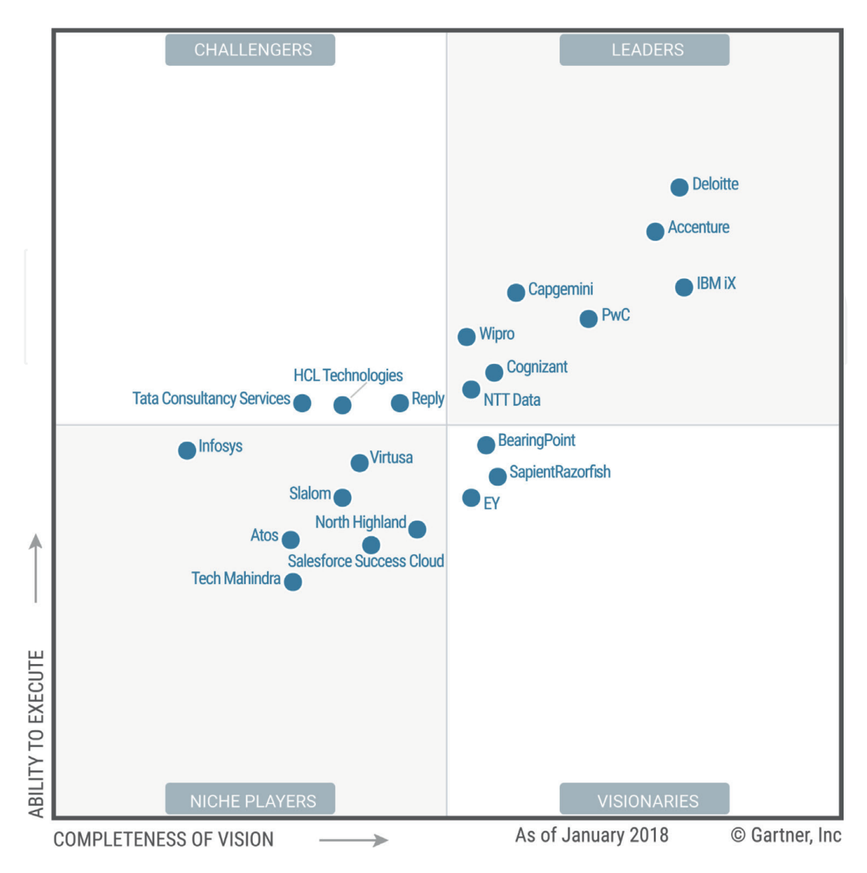
Figure 2. Magic quadrant for CRM and Customer Experience Implementation Services, Worldwide (2018).

For example, DMP's customer segment targets on the online advertising campaigns. DMP uses big data and artificial intelligence algorithms to process large sets of user data from the various sources.