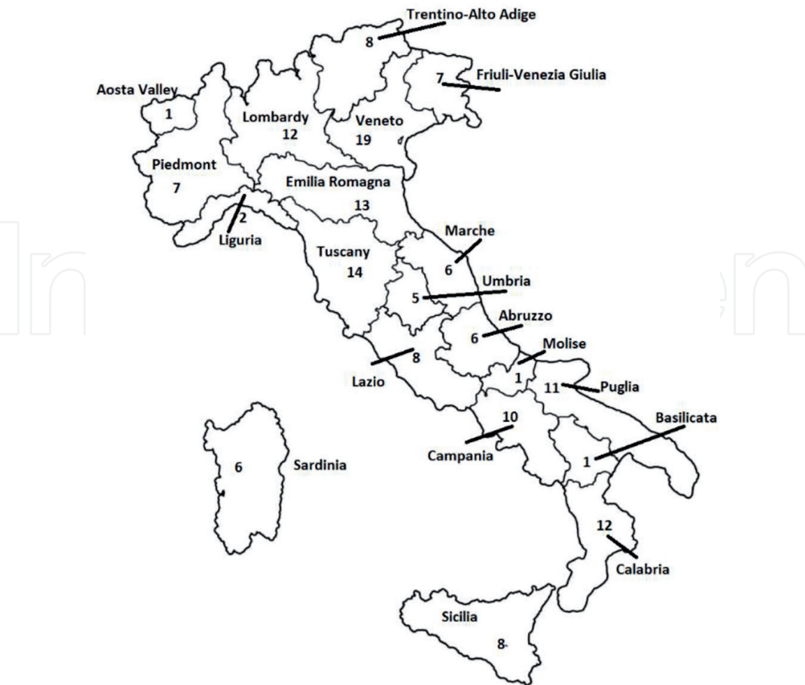
Figure 4. Wine routes in Italy (2019).

their structures from simple places of production into suitable structures for tourist accommodation.