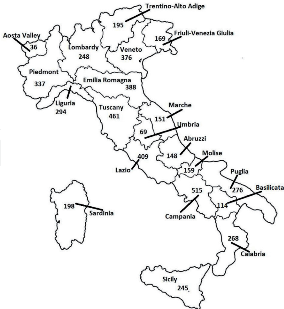
Figure 1. The regional distribution of Italy's typical products.

Local productions are part of the culture of a rural territory; they are elements of the past, expression of the traditions of a place that contribute, as argued by Dallen and Boyd [29], to a dynamic conservation of the landscape. Local products,