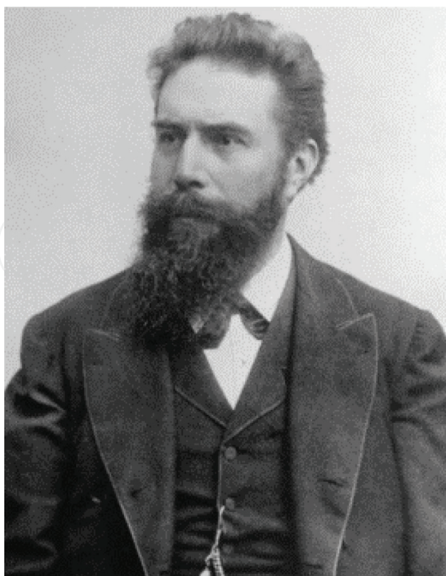
Figure 1. William Roentgen.