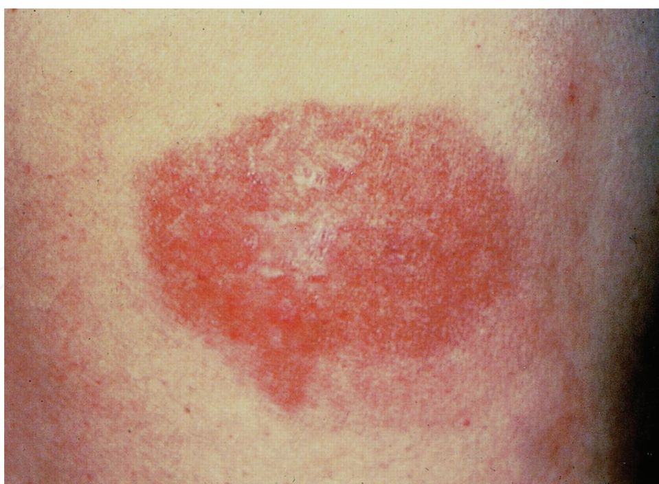
Figure 7. Photograph of right posterolateral chest wall at 10 weeks after PTCA for a 56-year-old man with obstructing lesion of right coronary artery [12].