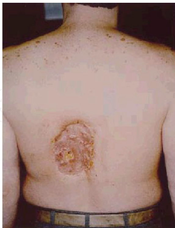
Figure 10. Radiation wound 22 months after angioplasty procedure [15].