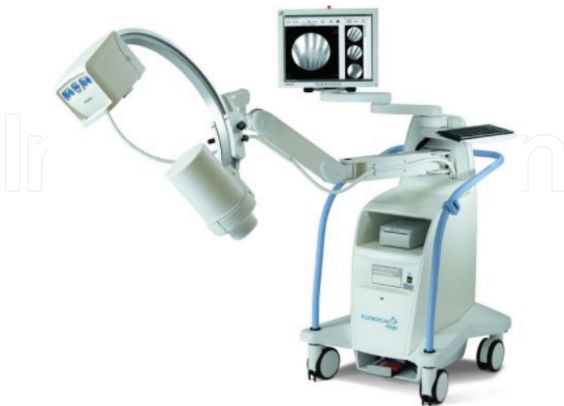
Figure 5. Mini C arm X-ray machine used for pediatric and extremities (1/10th of large C arm dose).