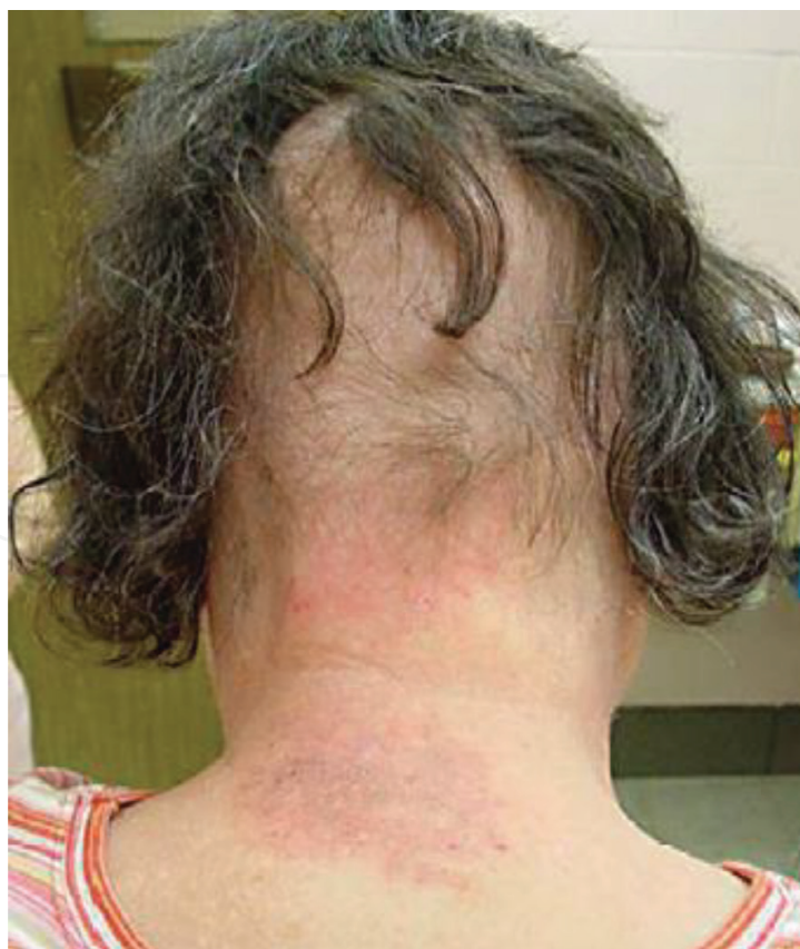
Figure 11. Radiation injury in a 60-year-old woman subsequent to successful neurointerventional procedure for the treatment of acute stroke [11].