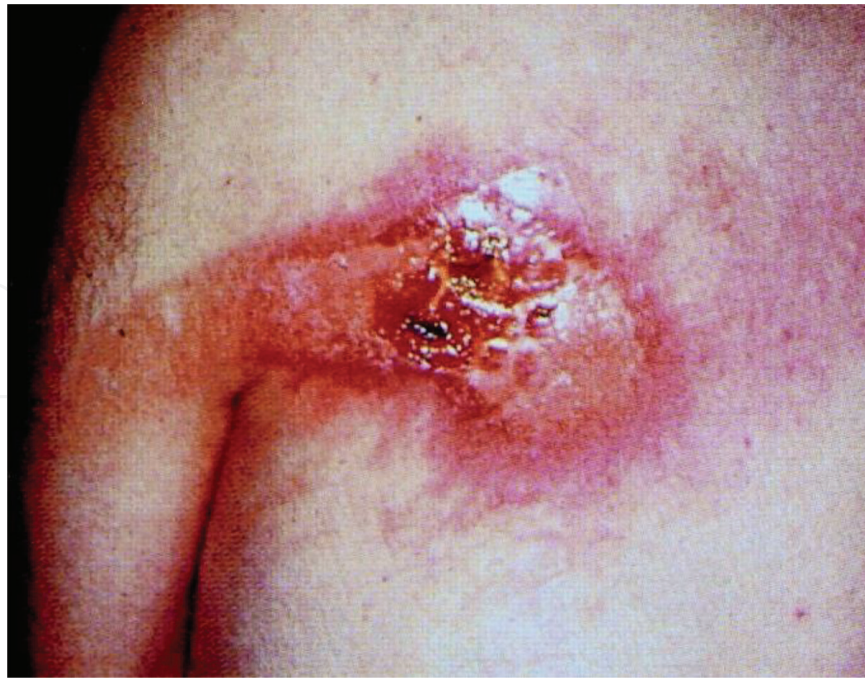
Figure 8. Secondary ulceration after two months for a 69-year-old patient underwent two angioplasties of left coronary artery within 30 hr [12].