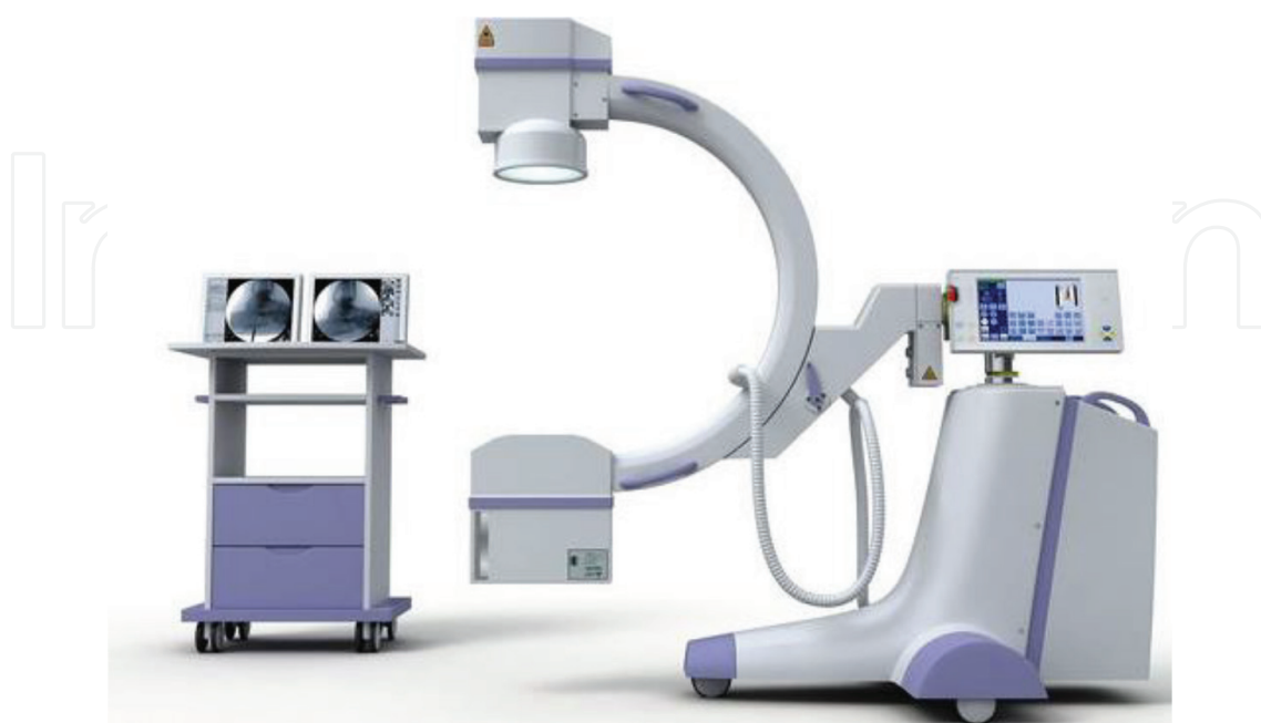
Figure 4. Modern C arm X-ray machine (large).