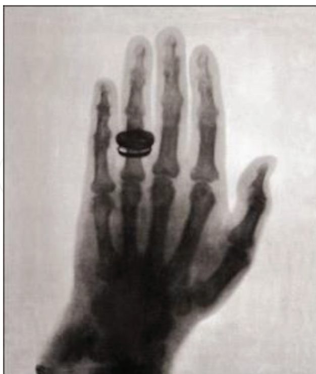
Figure 2. The first X-ray image (left hand of Bertha Roentgen).