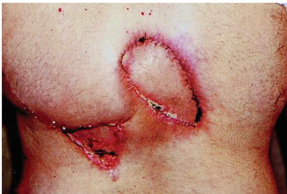
Figure 6. Tissue reaction effect for a 49-year-old patient who underwent two transjugular intrahepatic portosystemic shunt (TIPS) placements and one attempted TIPS placement within a week [12].