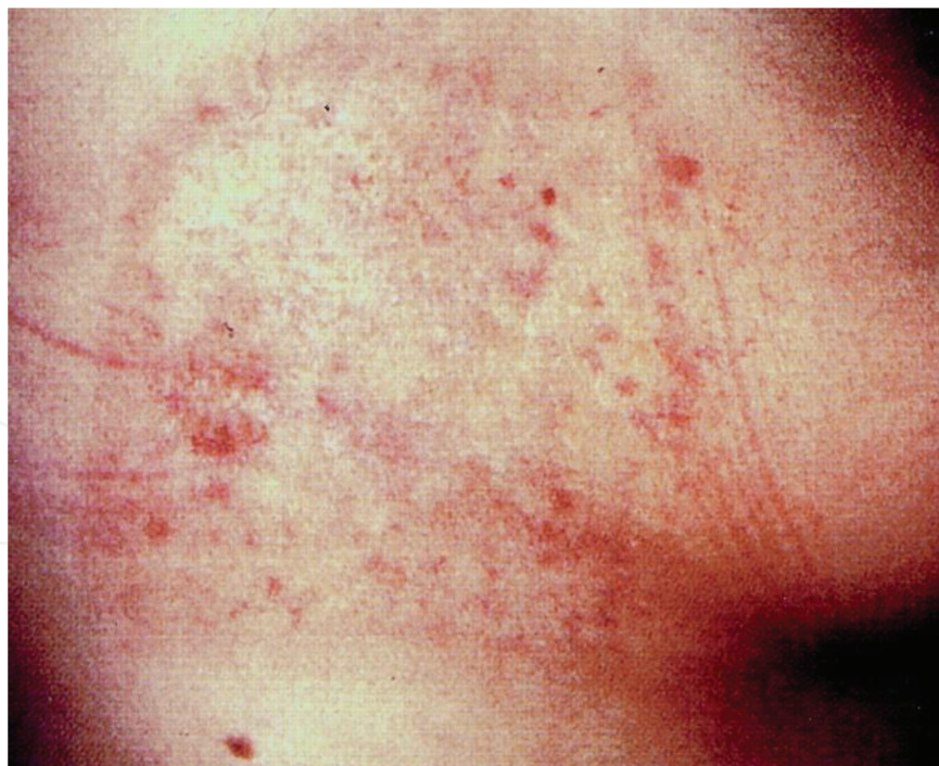
Figure 9. Skin telangiectasia after 2 years for a 17-year-old patient underwent two cardiac ablations procedures within 13 month [12].