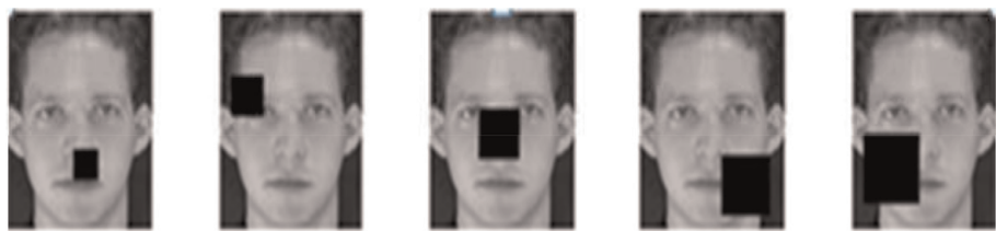
Figure 4. Occluded face samples from ORL dataset with patch sizes of 15 \times 15 , 20 \times 20 , 25 \times 25 , 30 \times 30 , and 35 \times 35 .