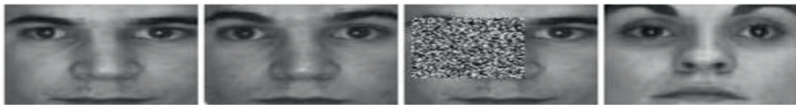
Original image same subject occluded subject difference subject