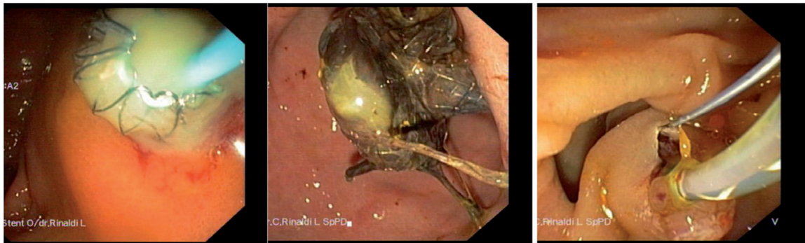
Figure 3. Patient with infected pancreatic pseudocyst and biliary obstruction (Courtesy: Dr. Cosmas Rinaldi A. Lesmana).

The clinical decision when to intervene the PFC is usually based on comprehensive clinical and imaging evaluation. Gastric outlet obstruction or biliary obstruction needs to be managed as soon as possible ( Figure 2 ). It can be recognized early through the clinical symptoms such as abdominal pain, vomiting, weight loss, early satiety, or even jaundice. Infected PPC is one of the absolute indications for drainage procedure ( Figure 3 ). Imaging evaluation as well as the fluoroscopy-guided or transabdominal-guided endoscopic management is considered as an important thing, especially in non-bulging PPC [19].