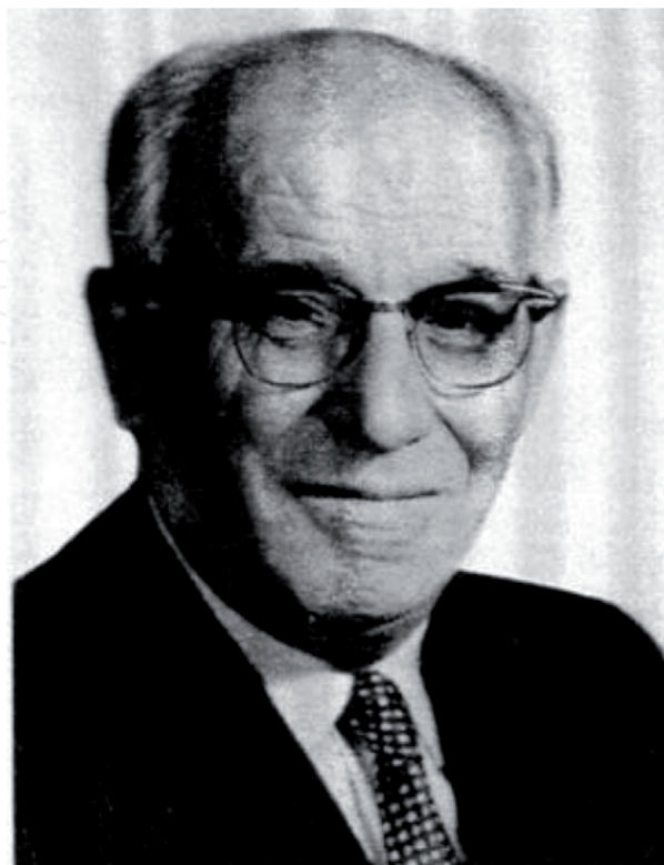
Dr. Philip Levine

In the mid-twentieth century, American researcher Philip Levine discovered Rhesus (Rh) factor and classified the blood as Rh (+) and Rh (-).