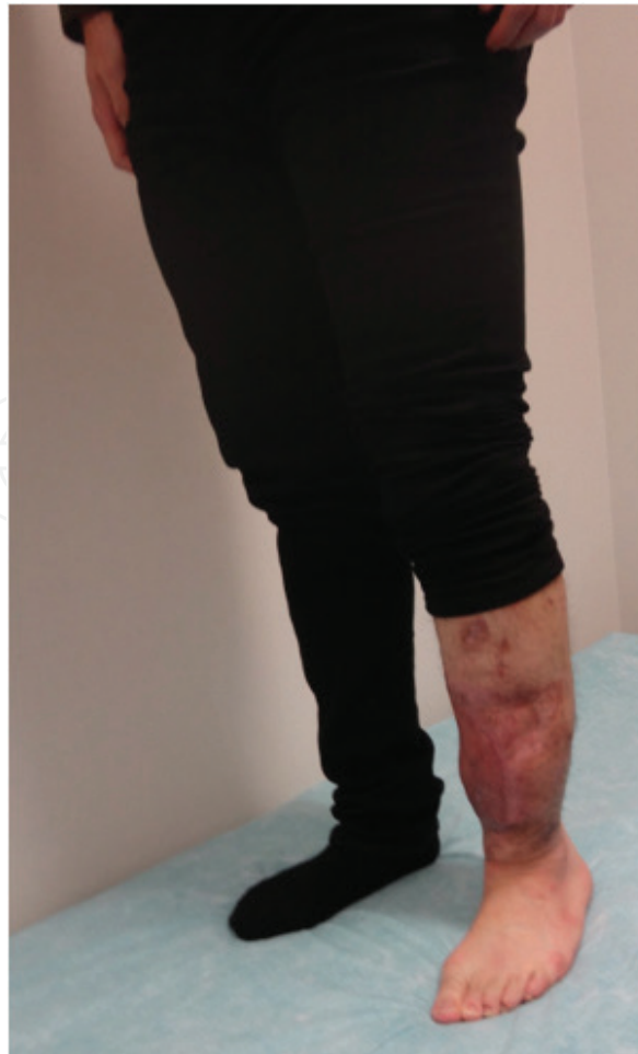
Figure 4. The patient could walk 1-year after surgery.

As result, previously non-salvageable limbs have been salvaged. However, there are many patients who require limb amputation. Circumstances of limb amputation may vary, including war wound, infections and animal bites, and traffic accidents and various diseases [2, 3].