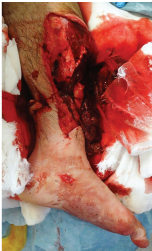
Figure 3. The photograph shows a Gustilo-Anderson IIIC bone-exposing fracture of the left fibula and tibia with severe abrasion of the skin and muscles.