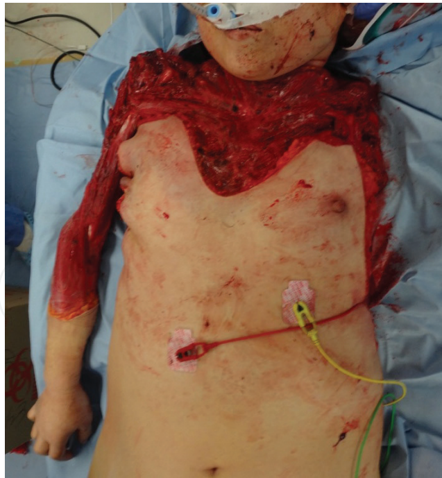
Figure 8. Intraoperative photographs show immediate amputation of the left arm and the complete removal of the infected skin of the right arm and chest.

myofasciitis, and a reported 23% of patients die of vibrio, and 20–34% die of group A streptococci infection [15]. Regarding surgical intervention, early and appropriate debridement to reduce infection is recommended to achieve infection control. Thus, surgical debridement including limb amputation should be considered in the early stage.