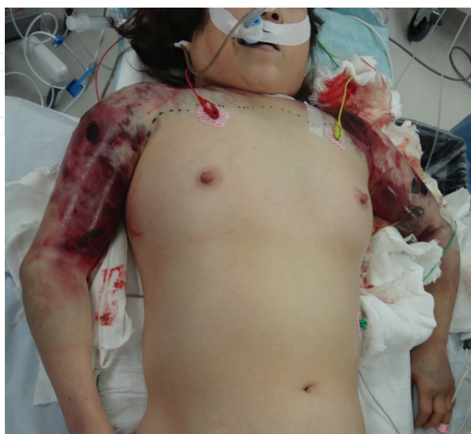
Figure 7. The photographs show a patient with group A streptococci infection of the bilateral upper lower limbs, which led to streptococcal toxic shock syndrome.

Necrotizing fasciitis and myositis are life-threatening infections with associated mortality rates of 10–20% [14]. Especially, Vibrio vulnificus and group A streptococci often cause aggressive and fatal gangrene and necrotizing