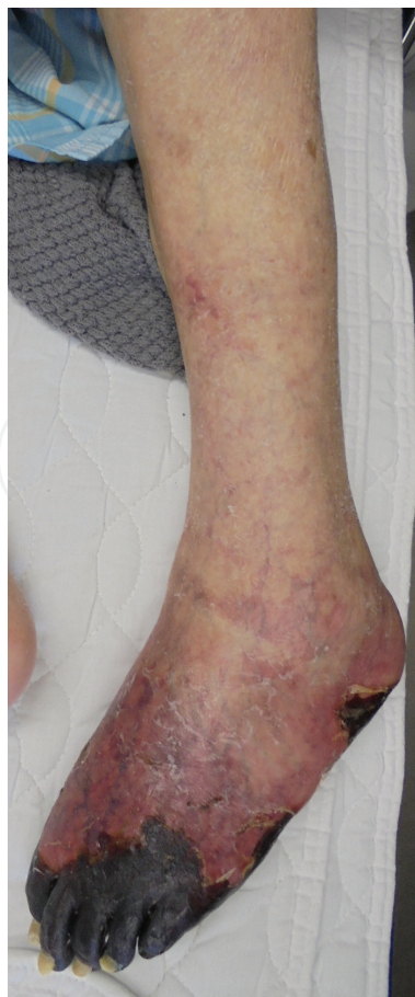
Figure 5. The photograph shows an ischemic foot due to peripheral arterial disease of the left leg, which required below-knee amputation.

Once a diabetic foot develops infection, it progresses rapidly and requires the removal of all necrotic tissue ( Figure 6 ).