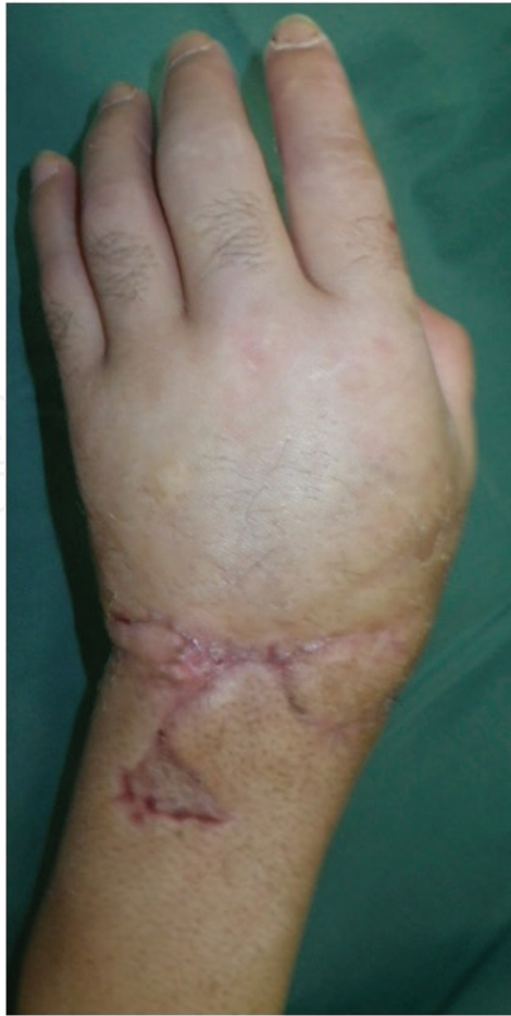
Figure 2. The photograph shows re-plantation of the severed hand.