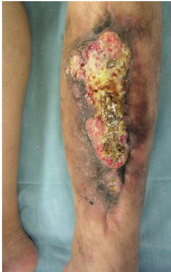
Figure 9. The photograph shows squamous cell carcinoma on the left leg invading the tibia, which required above-knee amputation.