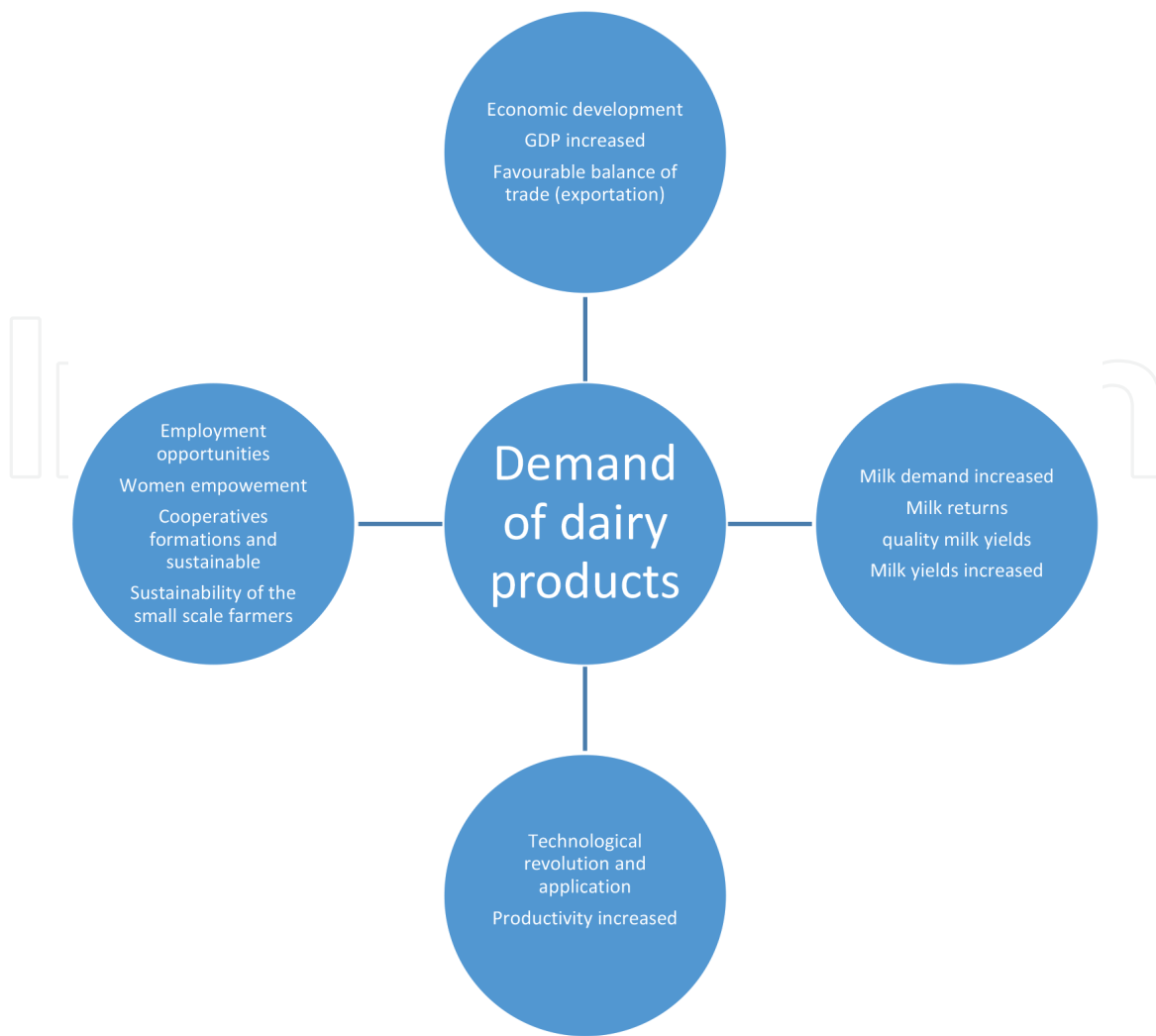
Figure 1. Effects on the demands of the dairy products.

The primary drivers of growth in demand remain population growth and growth in the per capita consumption of dairy products [2]. There is a plethora of benefits in improving the levels of milk production and profitability of dairy farmers. These include the following ( Figure 1 ):