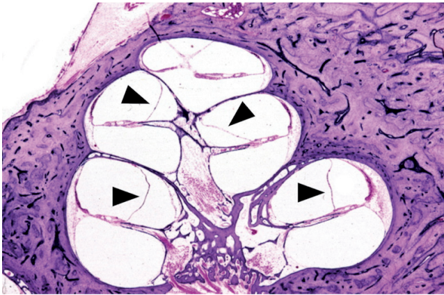
Figure 1. Reissner's membrane displaced in a temporal bone with hydrops (arrowheads).

Prosper Meniere, who worked as a director of the first school for the deaf-mute in Paris, described in 1861, a combination of vertigo, imbalance, and hearing impairment reflecting an inner ear disease [1]. But, only in 1937, with the discovery of endolymphatic hydrops (EH) in human temporal bones by Yamakawa and Hallpike and Cairns, the pathologic displacement of Reissner's membrane into the scala vestibuli—and so with the dilation of the scala media of the cochlea—was first established ( Figure 1 ) [5].