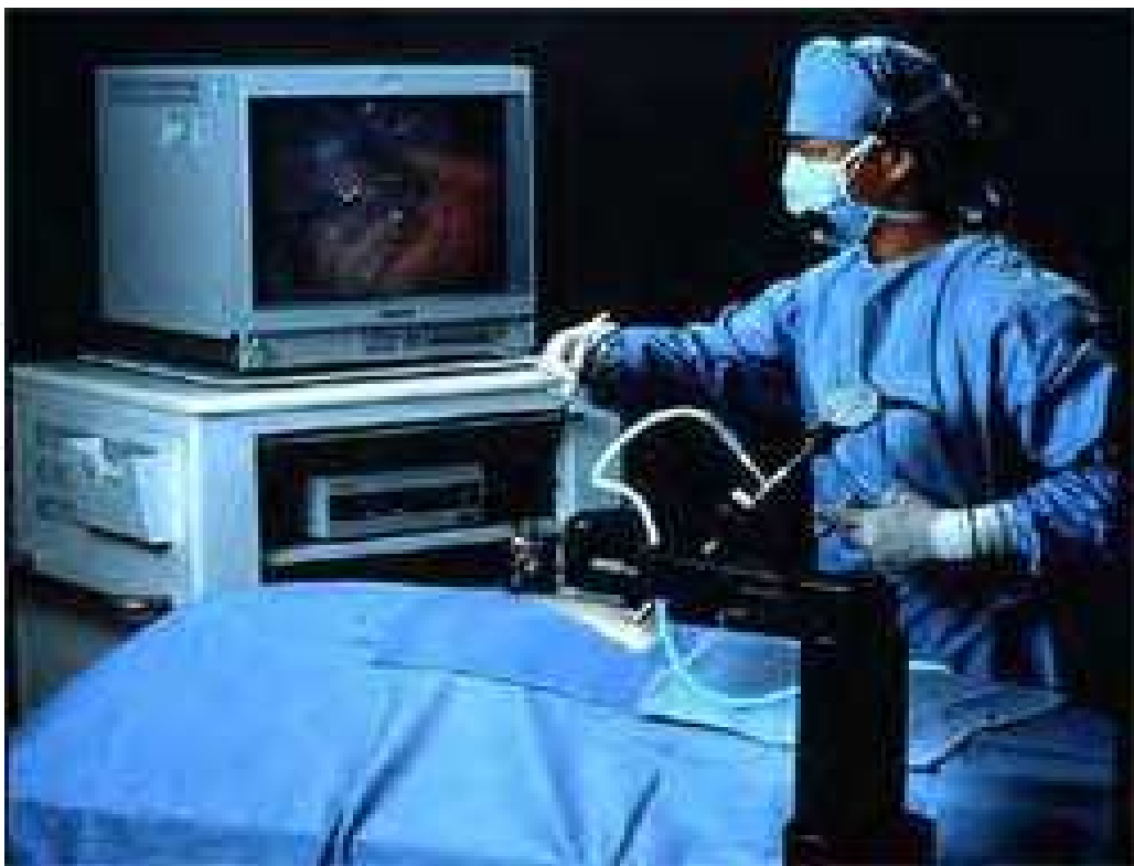
Figure 4. AESOP®.