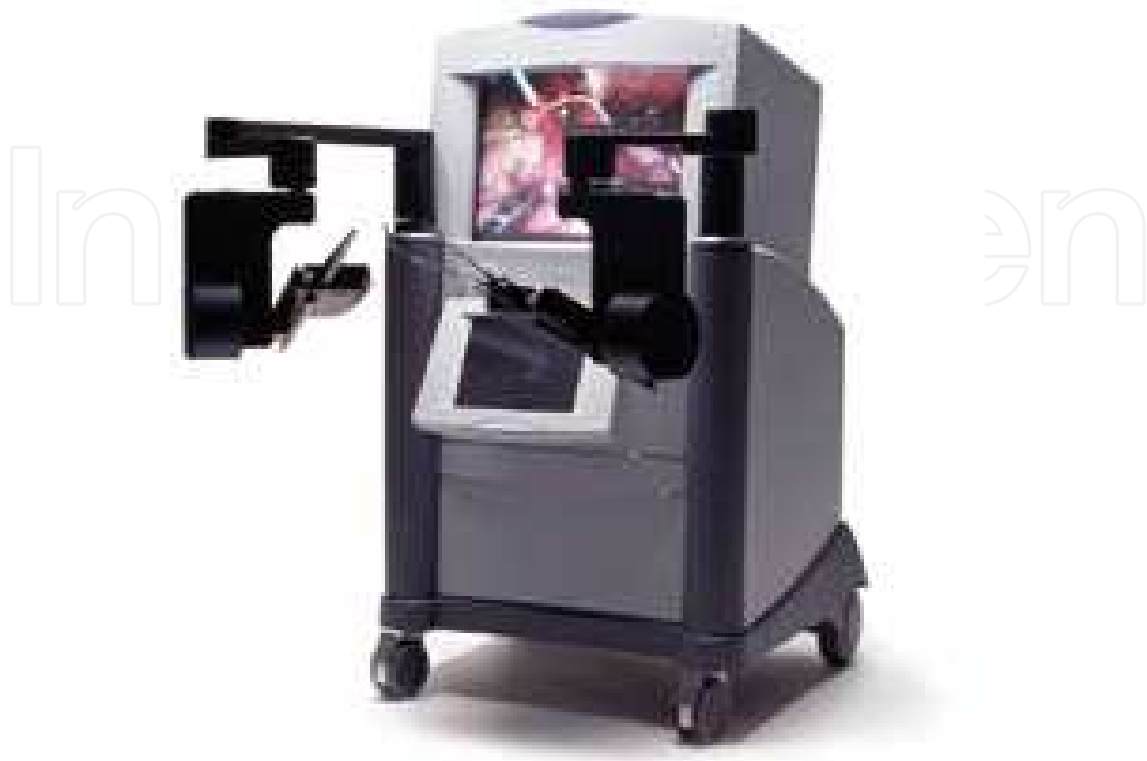
Figure 4. The ZEUS® Surgical System. The camera holder and driver is actually an AESOP derivative which uses AESOP® Endoscope Positioner technology

can be operated either by voice activation or by non verbal command. One of the drawbacks of ZEUS® is its cost which has been estimated at $1,000,000 USD (2007 Cost).