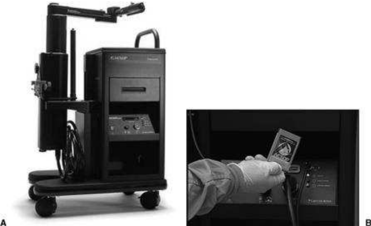
Figure 5. (A) The AESOP® with its camera holding arm (B) The signature voice card.