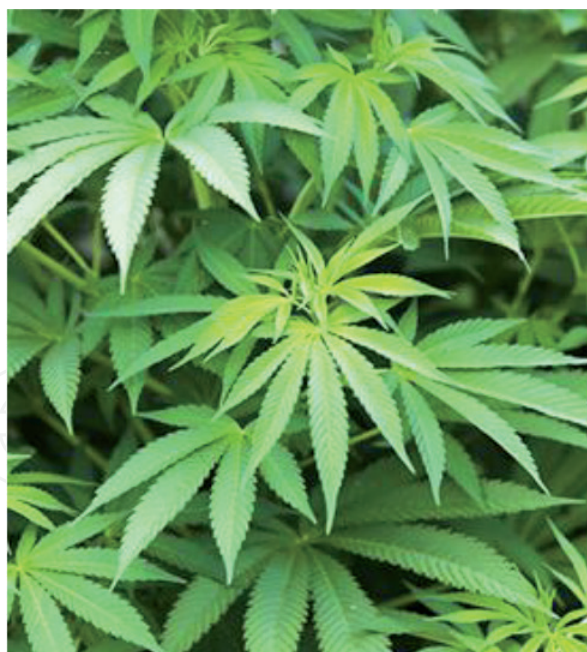
Figure 3. Cannabis sativa.

HIV-infected persons [96] and other conditions [39]. It is used as a decoction or infusion, alone or mixed with other herbs and taken daily as a preventative medicine, and it would be obtained from THPs [39, 94]. The legalisation certainly provides an environment for continued use of the plant as ATM and obligates that more research should be done to explore further benefits of medicinal cannabis. Hence, the regulations around granting licence for research may need to be reviewed in light of the ruling ( Figure 3 ).